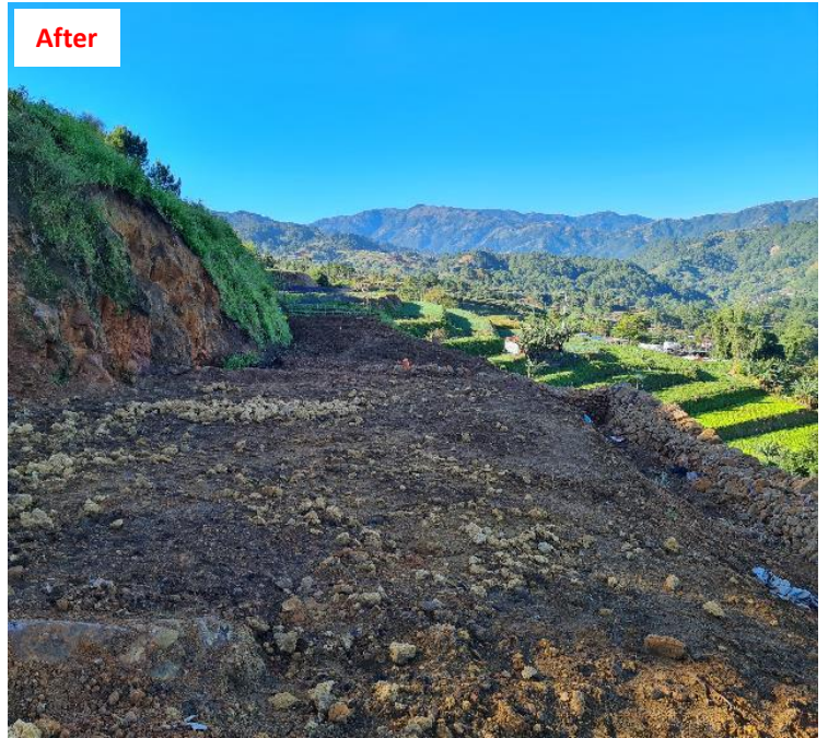
Finalized site rehabilitation for CDH-61.