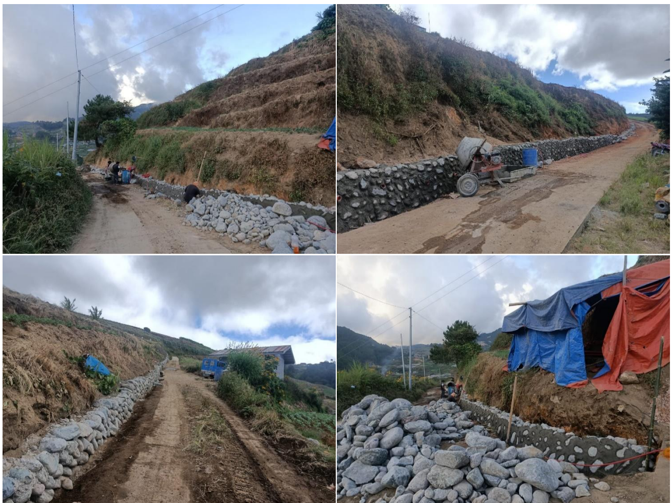
Colocol-Cotcot culvert project have started.