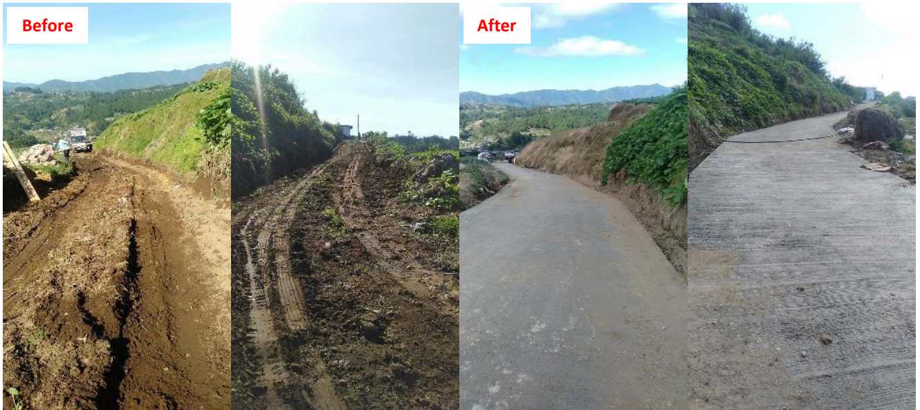
Completed construction of concrete pavement at Upper Colocol.