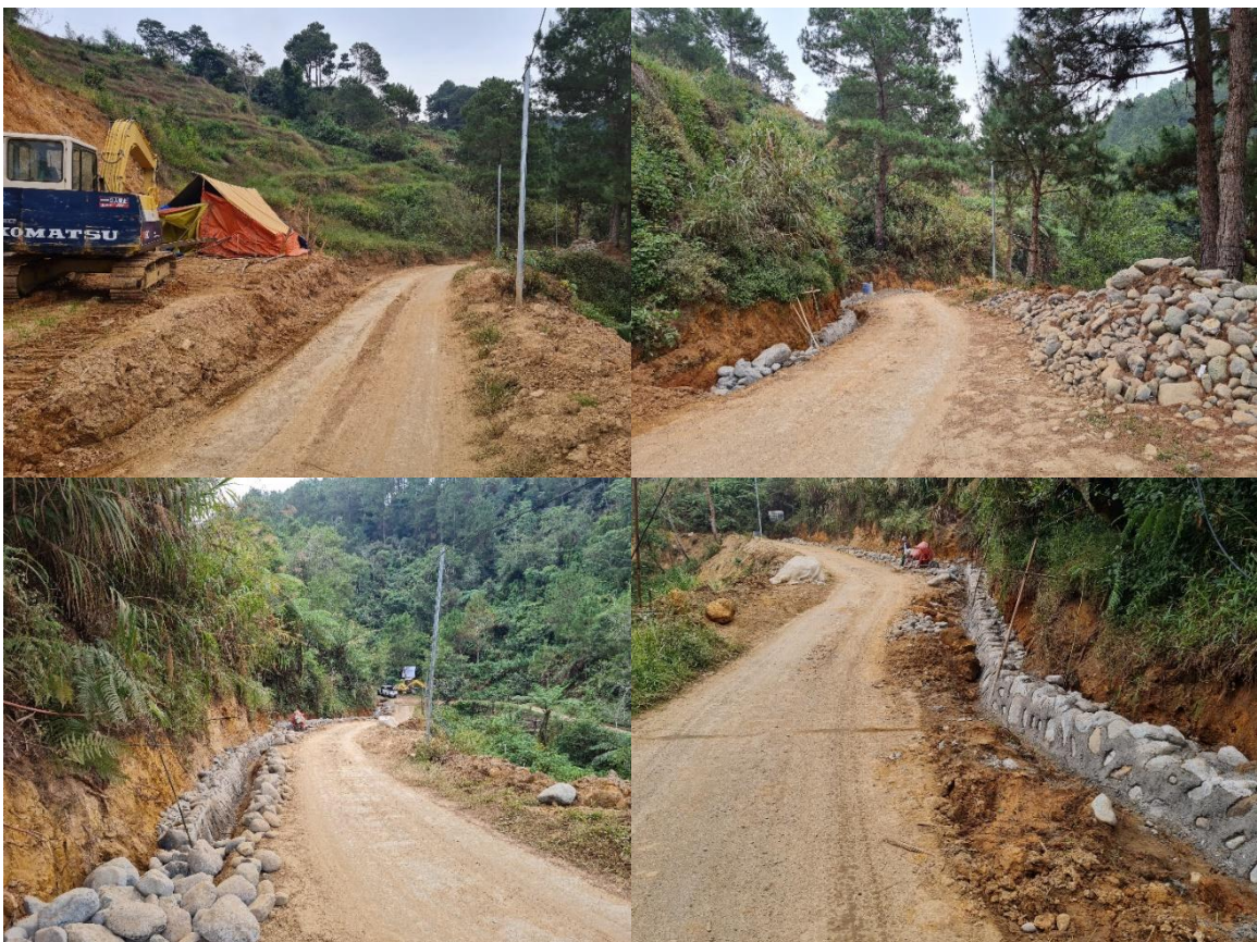
Photo 7. Riprapping excavation works from Magangan creek going uphill to Sitio Colocol.