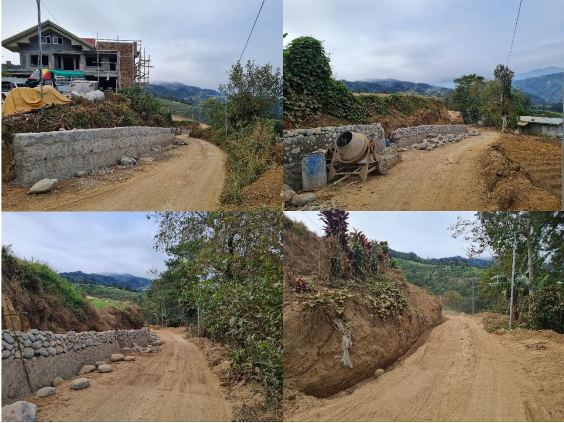
Photo 6. Riprapping excavation works going downhill to Sitio Colocol.