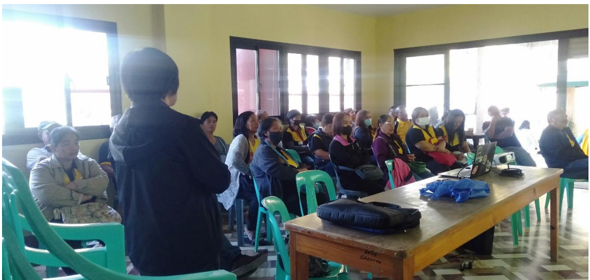
Photo 3. IEC on Barangay Guinaoang last January 27.