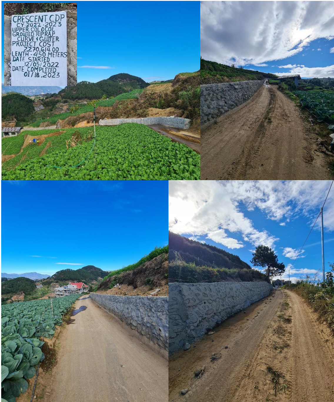
Photo 4. Riprap and drainage canals project in upper Sitio Colocol completed last January 18.