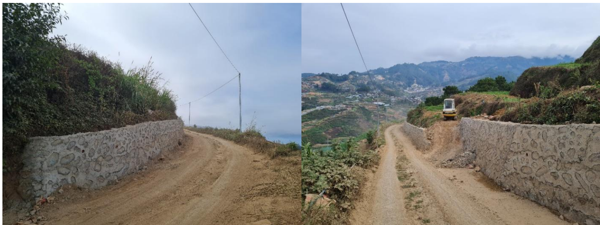
Photo 5. Riprap extension towards CDH-61 drill site.