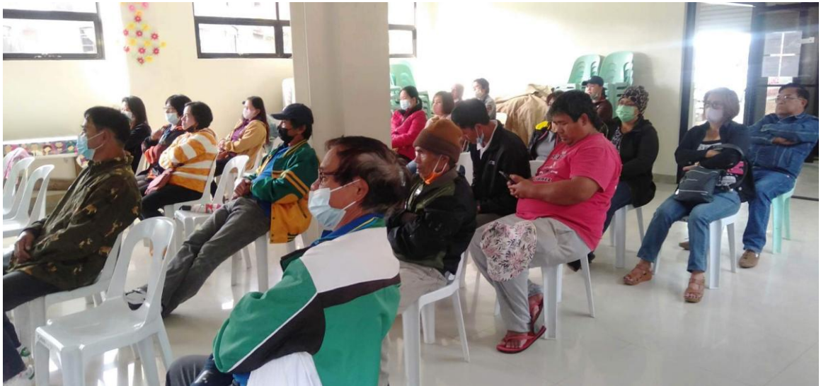
Photo 2. IEC on Barangay Guinaoang last January 13.