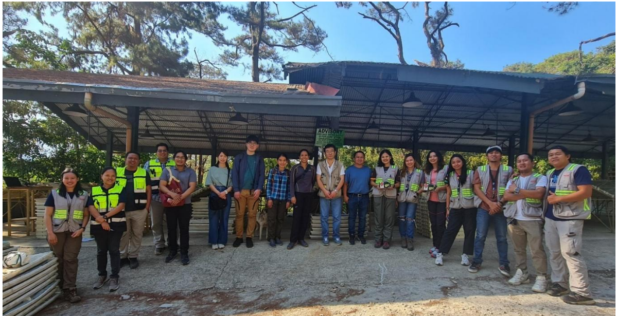
Photo 5. Presentation and discussions at LCMC Exploration Core House.