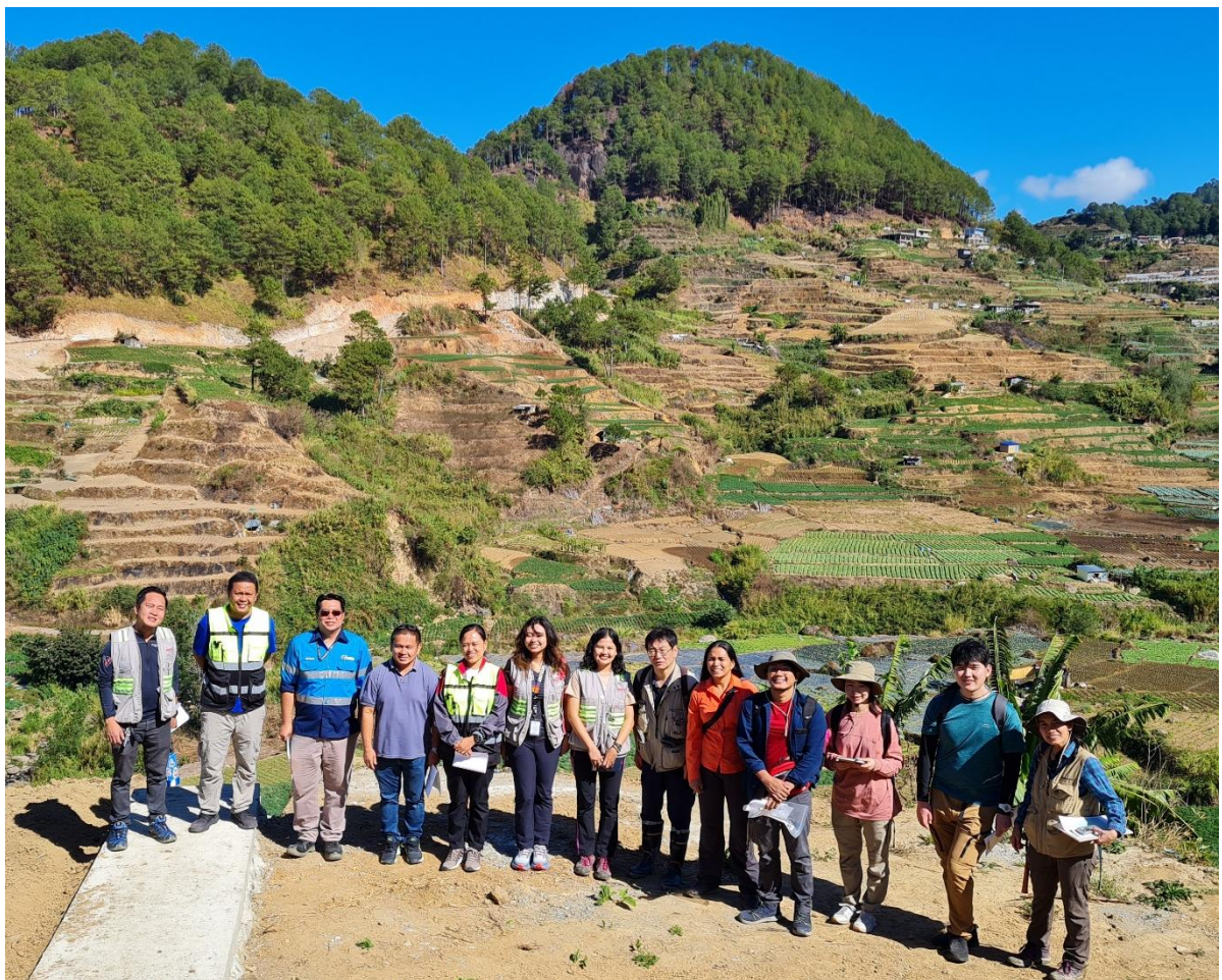
Photo 3. Visitors given an overview of the surface extensions of the Guinaoang Deposit.