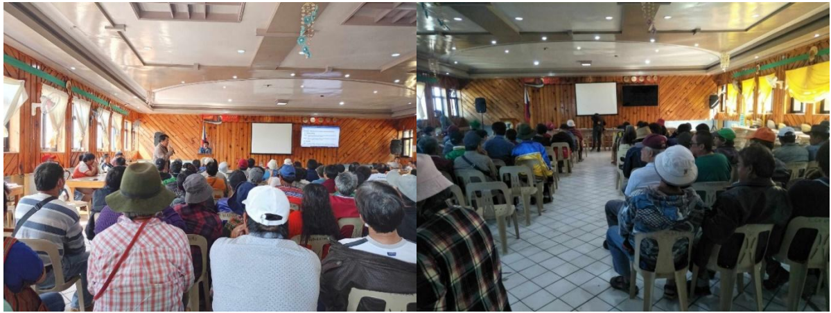
Photo 7. NCIP presentation of the new guidelines for IPMR selection held last Feb 24.