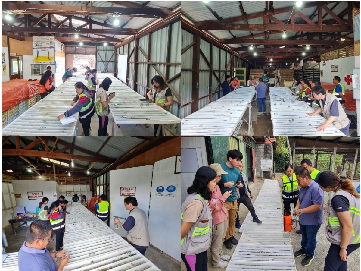
Photo 2. Visitors looking at BRC-60 cores discussing lithology, alteration, and mineralization observed in the core.