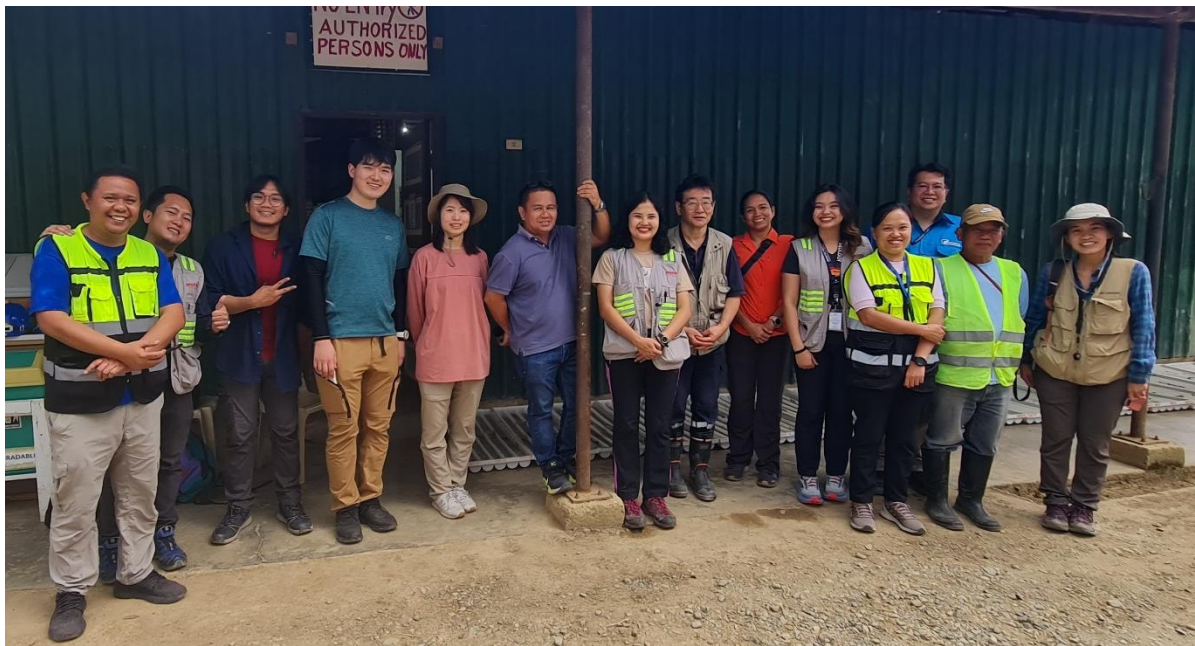
Photo 1. Visitors from UP-NIGS, Akita University, Kyushu University, and Lepanto Exploration Geologists.