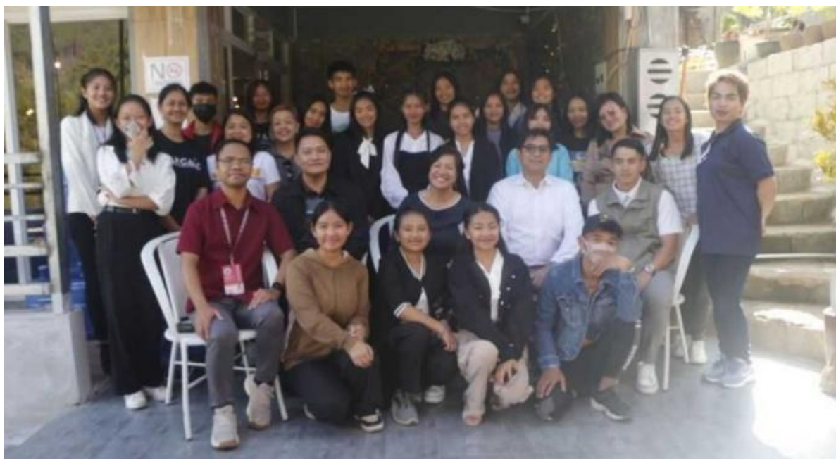
Photo 12. Guinaoang National High School Suicide Prevention Workshop.