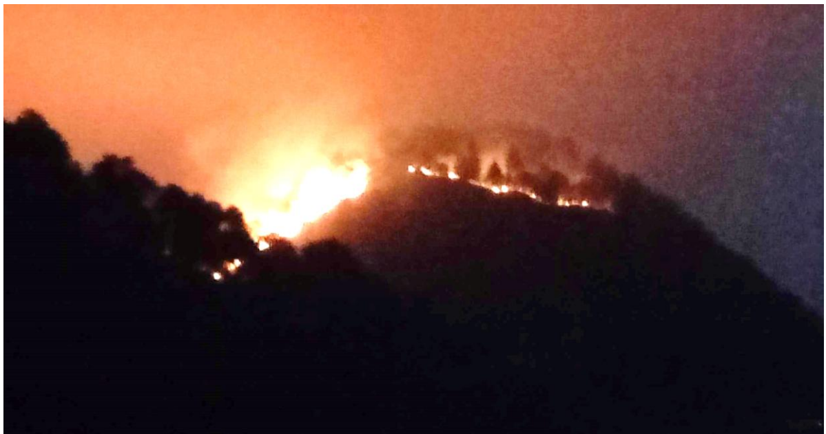
Photo 16. Forest fire last Feb 14, engulfing Posdo Hill.