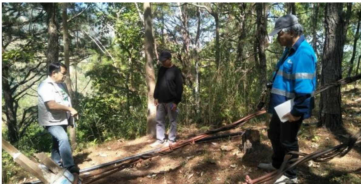
Photo 18. Site visit to proposed area for Adopt a Forest in Brgy. Cabitin.