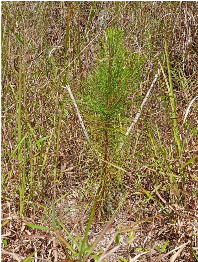
Photo 15. Monitoring of seedlings planted at Posdo Hill in Brgy. Guinaoang