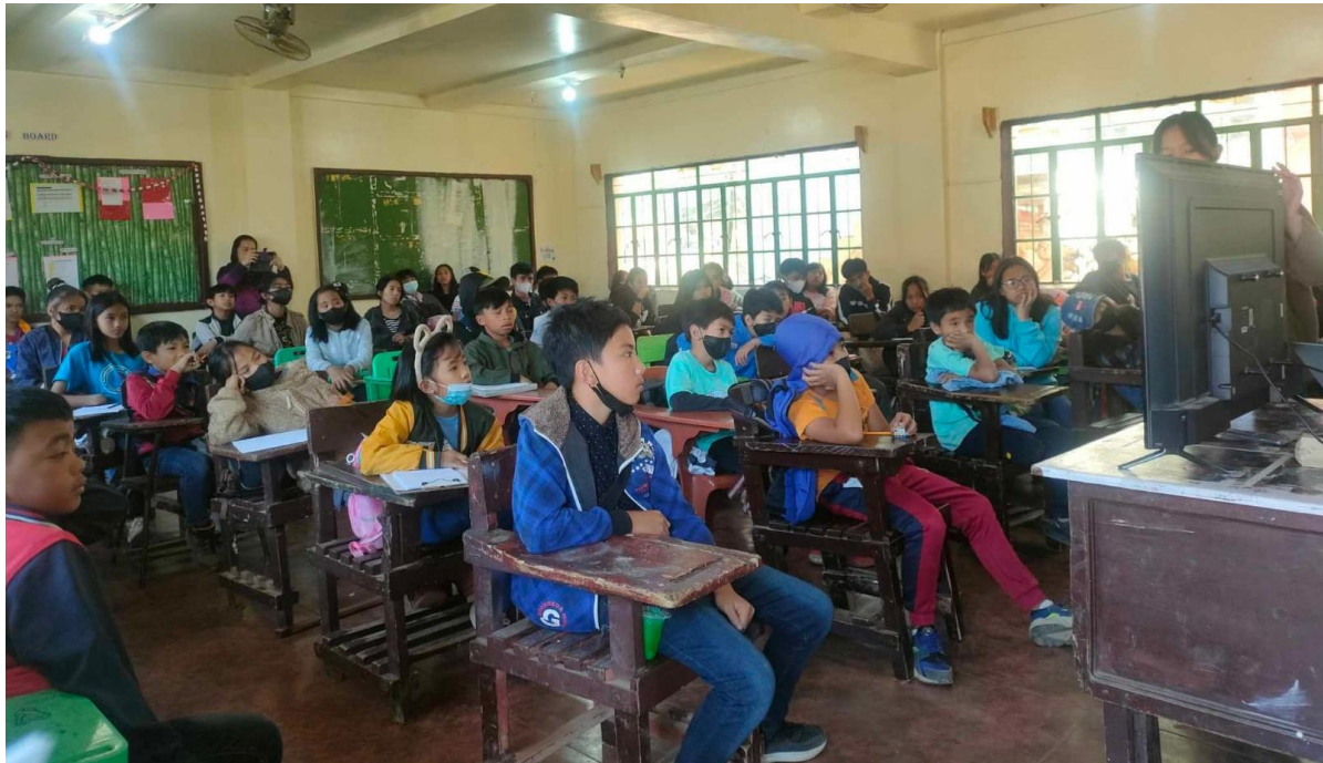
Photo 13. District Press Conference held at Guinaoang National High School last Feb 10.