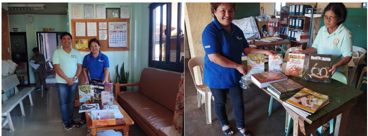
Photo 7. Turnover of health books and materials to Guinaoang (left) and Bulalacao (right) Health Stations.