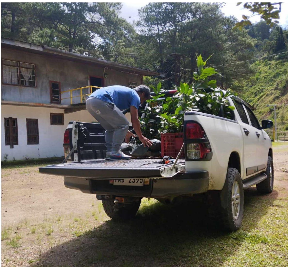
Photo 11. Hauling of ice cream bean seedlings at ISRI for the tree planting activity at Brgy. Tabio.