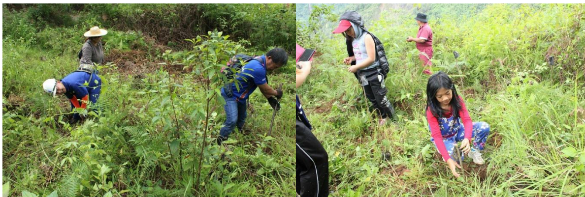
Photo 13. Tree planting activity at Brgy. Tabio as part of the Cordillera Day celebration. CMDC staff, Tabio Barangay Council, and members of LAMAPASEC Youth Organization joined the activity.