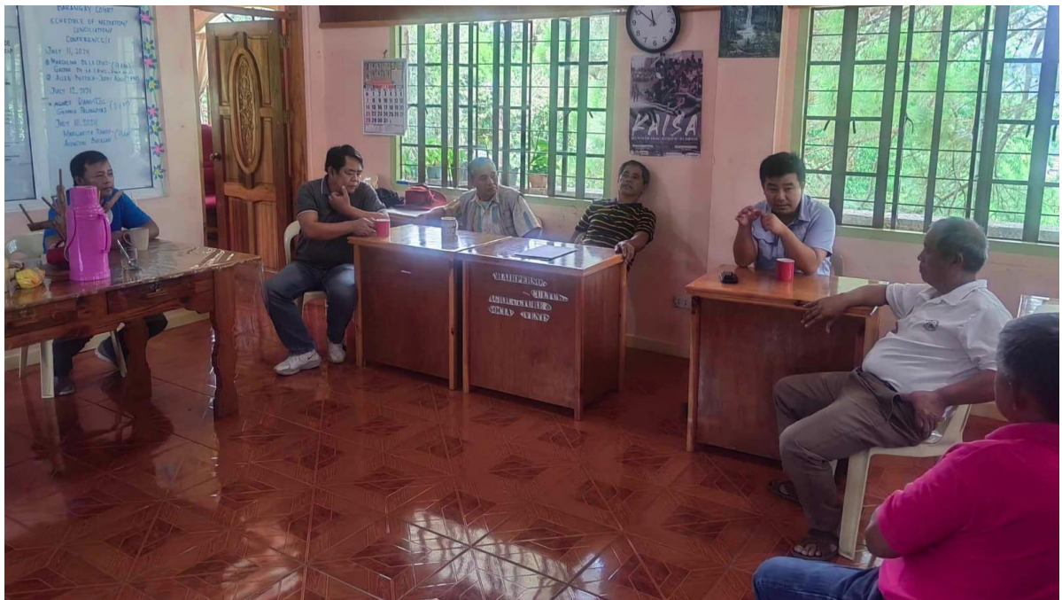
Photo 5. Meeting with IPMR and CoEIs at Brgy. Tabio last Jul 11.