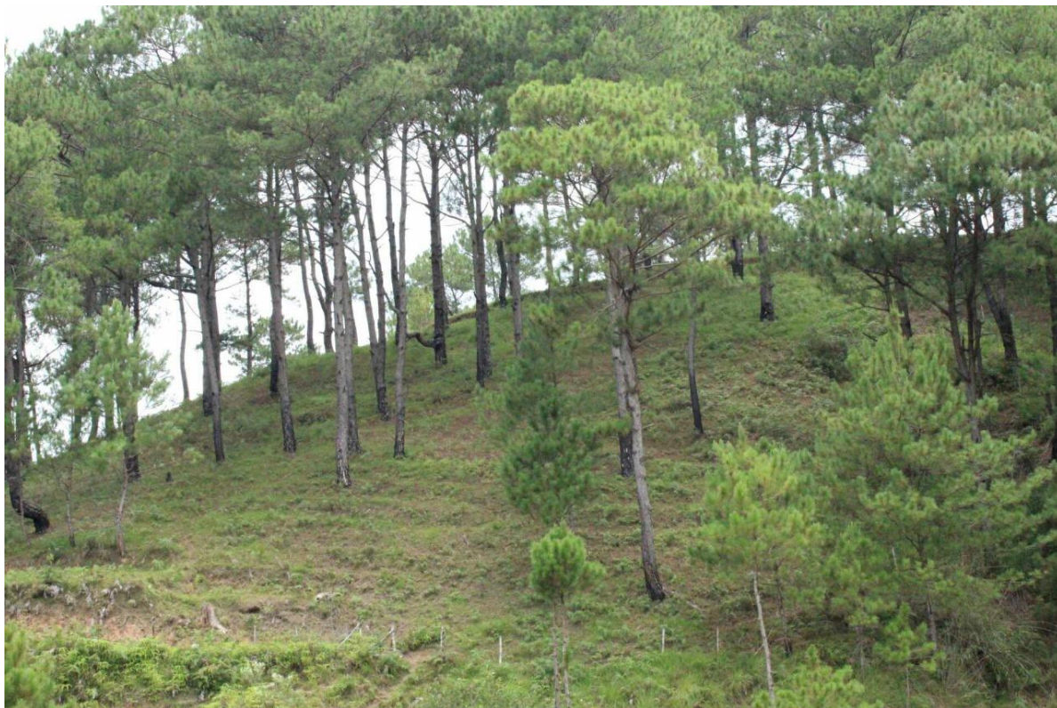
Photo 10. Proposed tree planting area at Dongyoyan, Guinaoang.