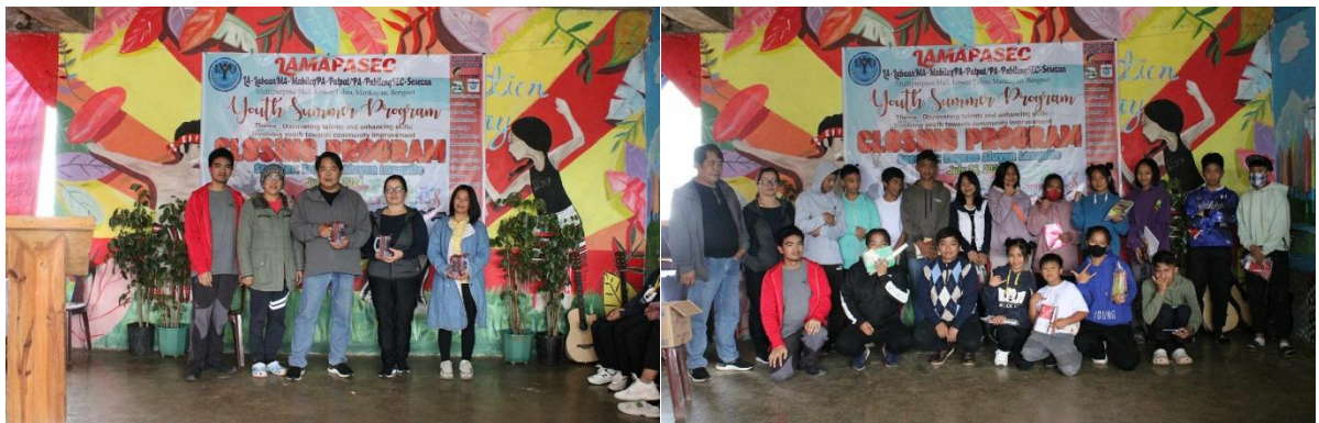
Photo 6. Closing ceremonies of the LAMAPASEC Youth Summer Program held last Jul 27. (Left) Teachers and CMDC staffs received tokens of appreciation for the assistance they have provided for the activity. (Right) Souvenir photo with some of the children who attended the Summer Program.