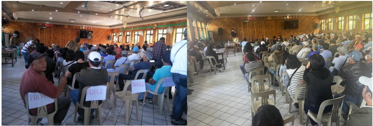
Photo 19. Representatives from different barangays attended the domain-wide consensus.