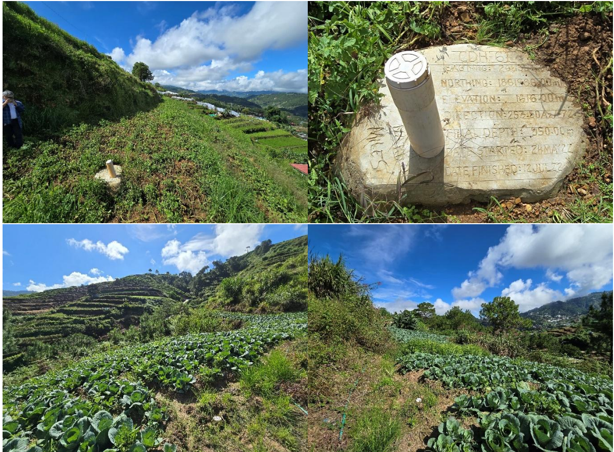
Photo 1. TSHES Safety & Health and Environmental auditors visited the rehabilitated drill platforms of CDH-61 (top photos) and CDH-62A (bottom photos).