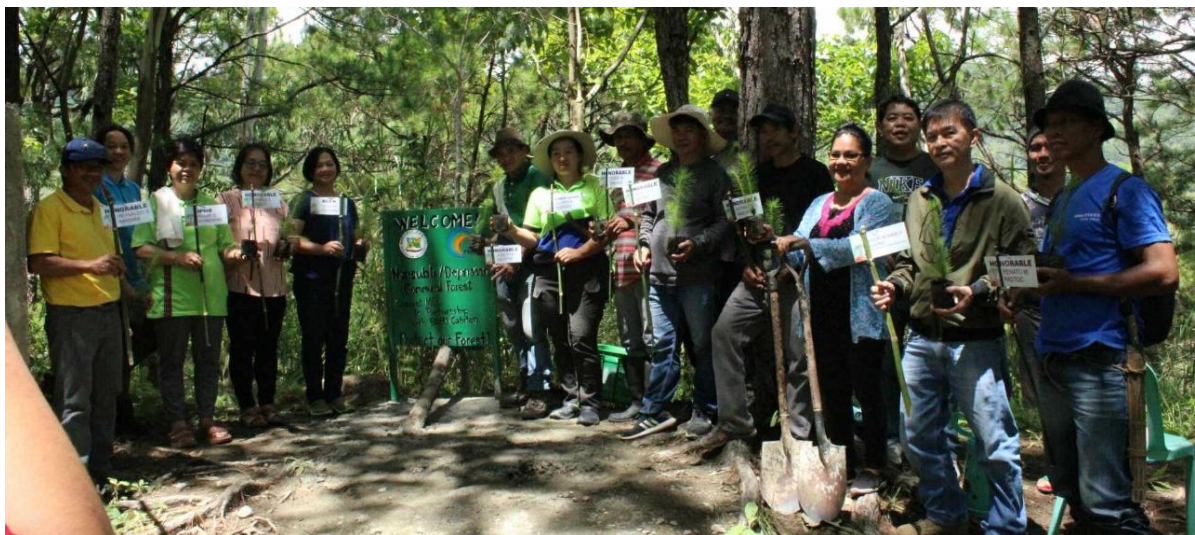
Photo 26. Tree planting activity by Brgy. Cabiten stakeholders during the Adopt a Forest Thanksgiving Program.