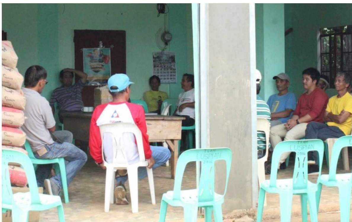
Photo 8. Engagement with elders and stakeholders of Upper Cabiten last Aug 18.