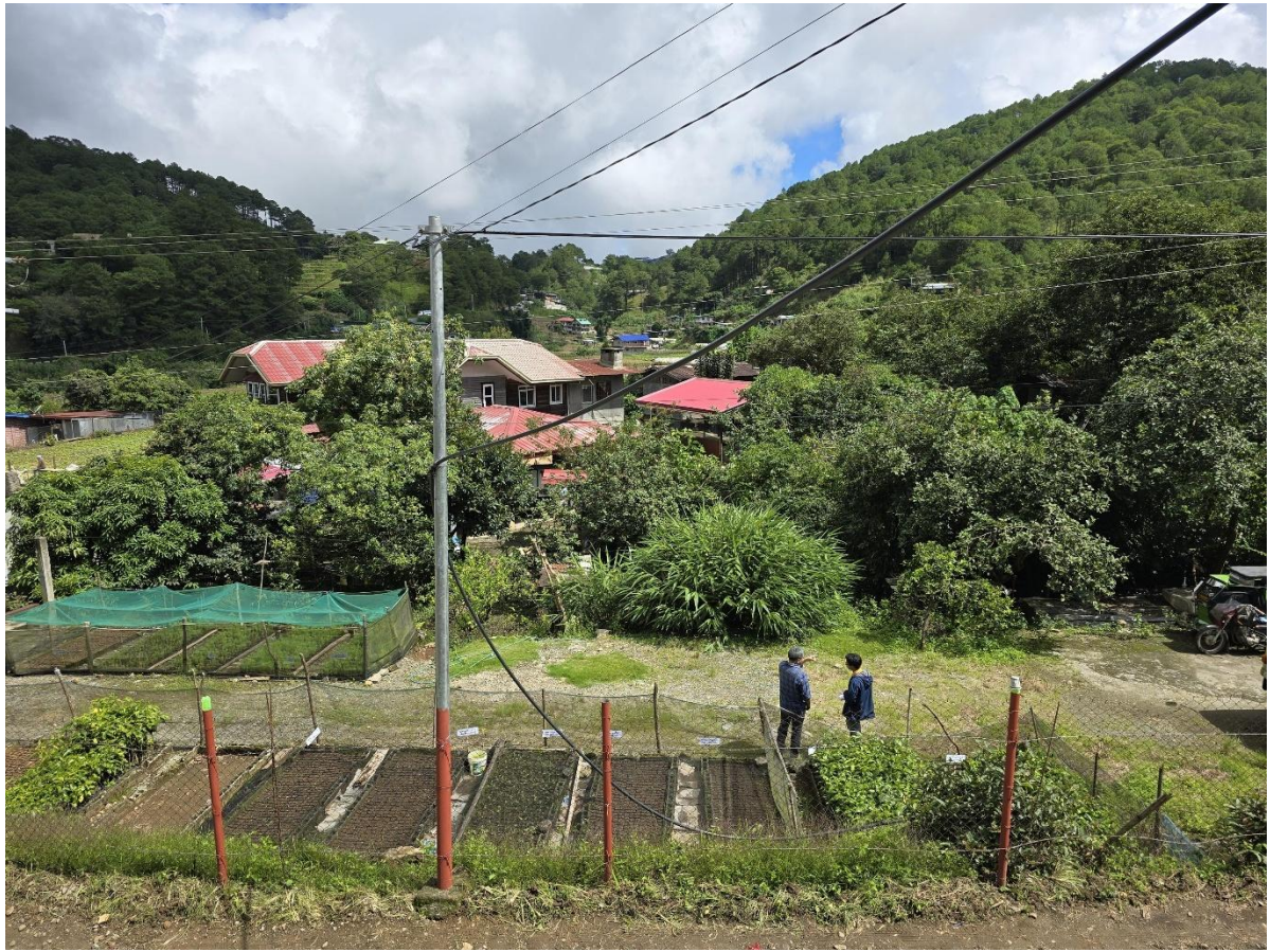
Photo 29. Quick visit at CMDC Nursery.