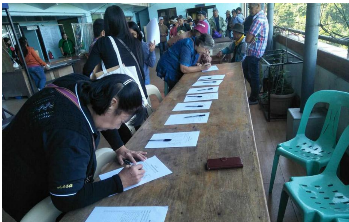
Photo 18. Registration proper for the domain-wide consensus held last Aug 21.