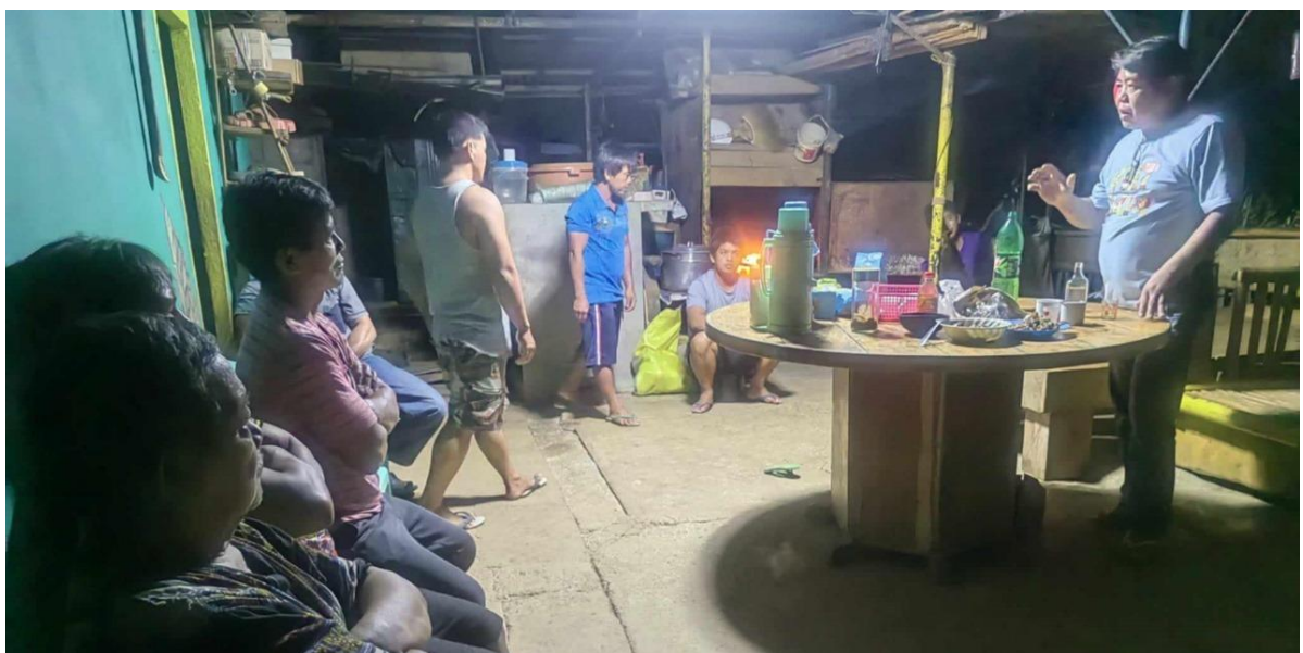
Photo 10. Engagement with elders and stakeholders of Sitio Mantiyeng last Aug 19.