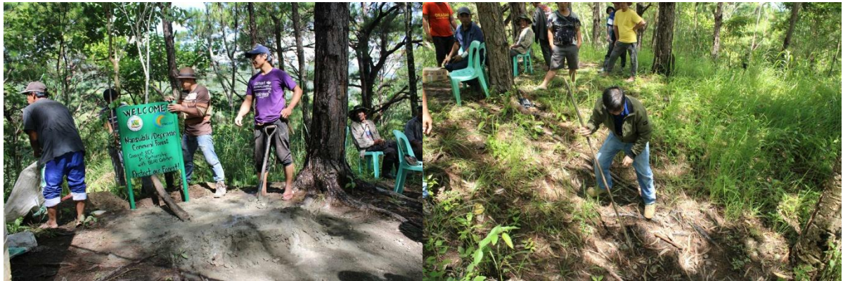
Photo 27. (Left) Cementing of Signage at the Adopted Forest site in Brgy. Cabiten. (Right) CMDC President spearheaded the tree planting activity.