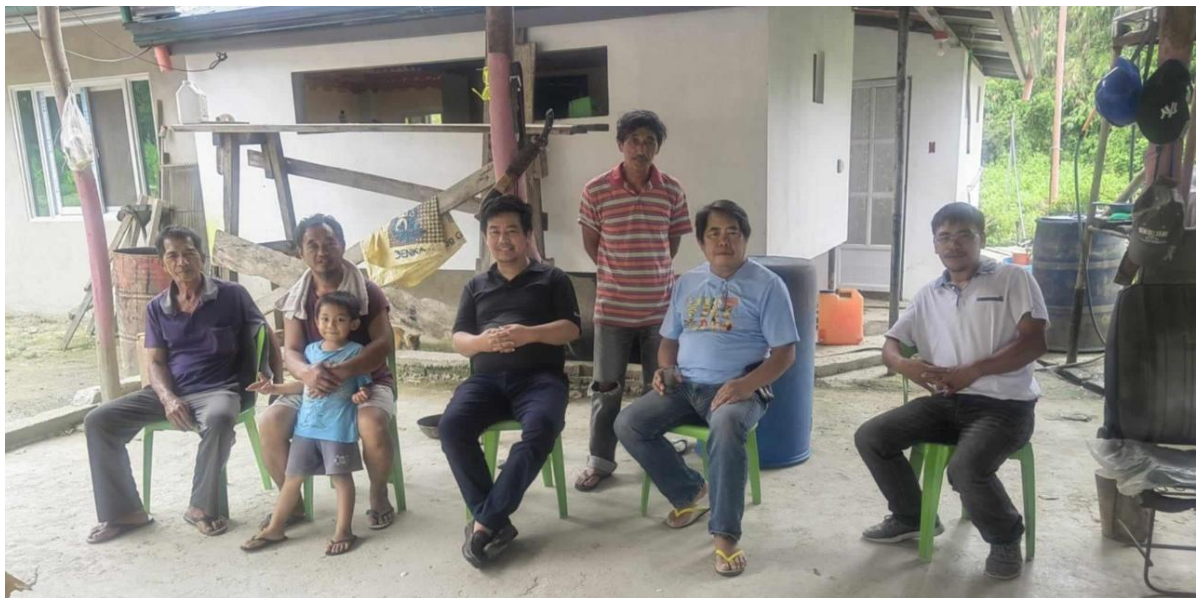
Photo 9. Engagement with elders and stakeholders of Sitio Batbato last Aug 19.