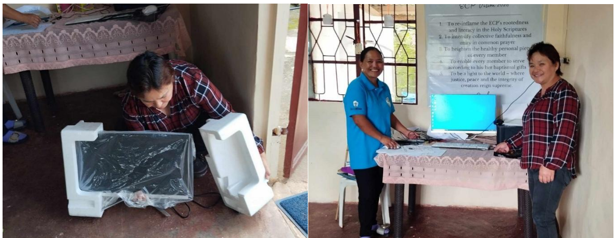
Photo 16. Turnover of desktop computer to Dowag Day Care Center.