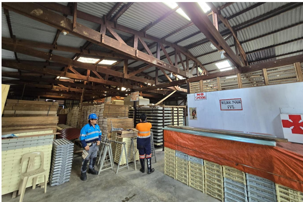
Photo 2. TSHES Safety & Health auditor visited the CMDC Core House Facility.