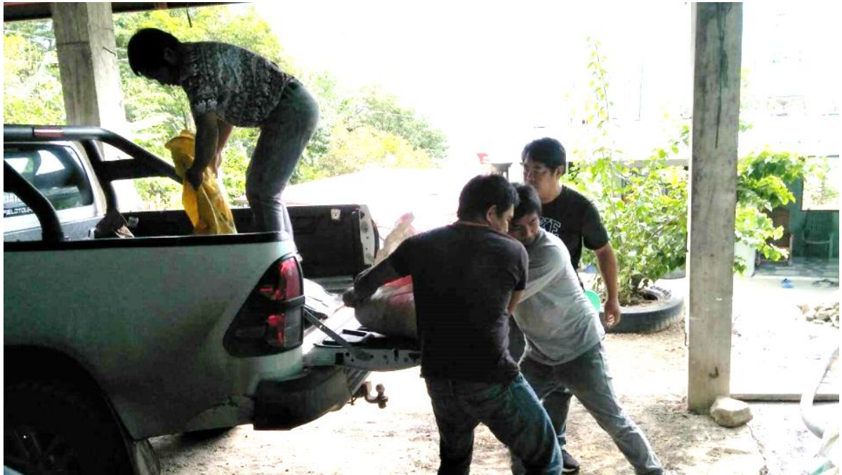
Photo 15. Delivery of construction materials for the signage of the adopted forest in Brgy. Cabiten.