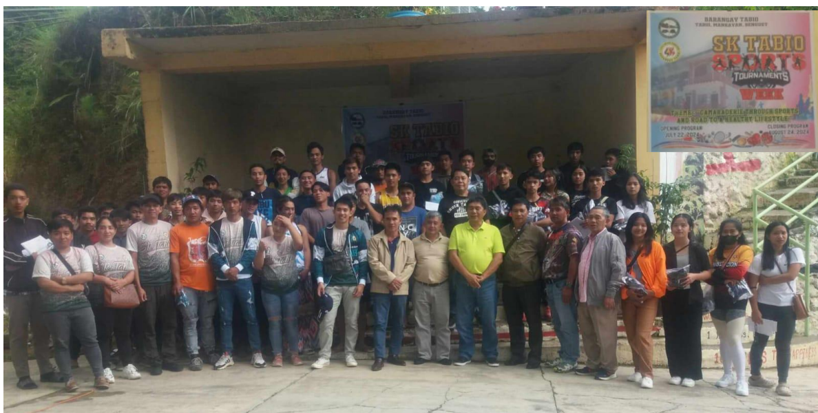
Photo 14. Brgy. Tabio SK Sports Program organizers and attendees of the closing program.