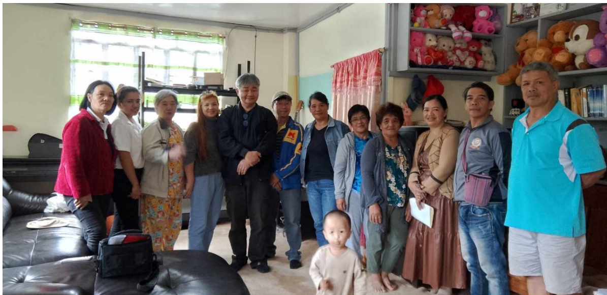
Photo 24. Meeting with Dongyoyan Coffee Farmers last Aug 14.