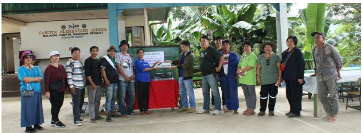
Photo 17. Turnover of laptop and printer for the use of various organizations in Brgy. Cabiten.