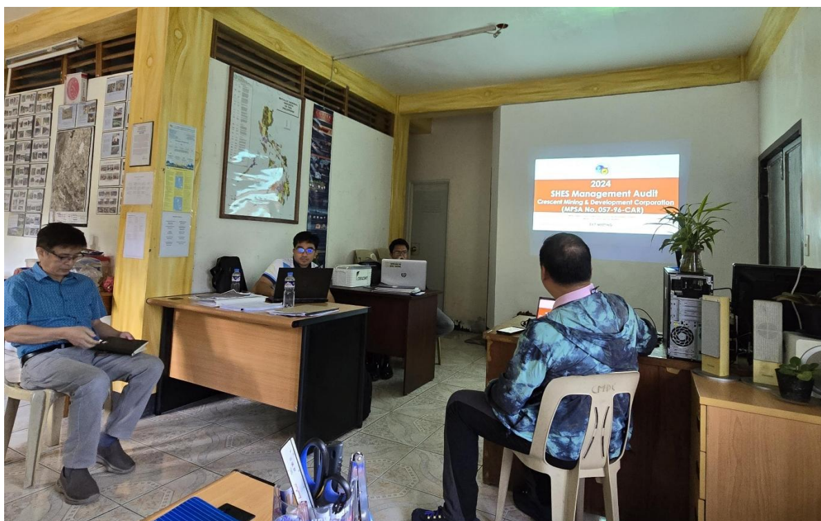
Photo 3. Discussions of the TSHES audit findings during the exit meeting held last Aug 07.