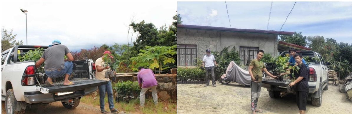
Photo 25. Distribution of coffee tree seedlings to Brgy. Cabiten.