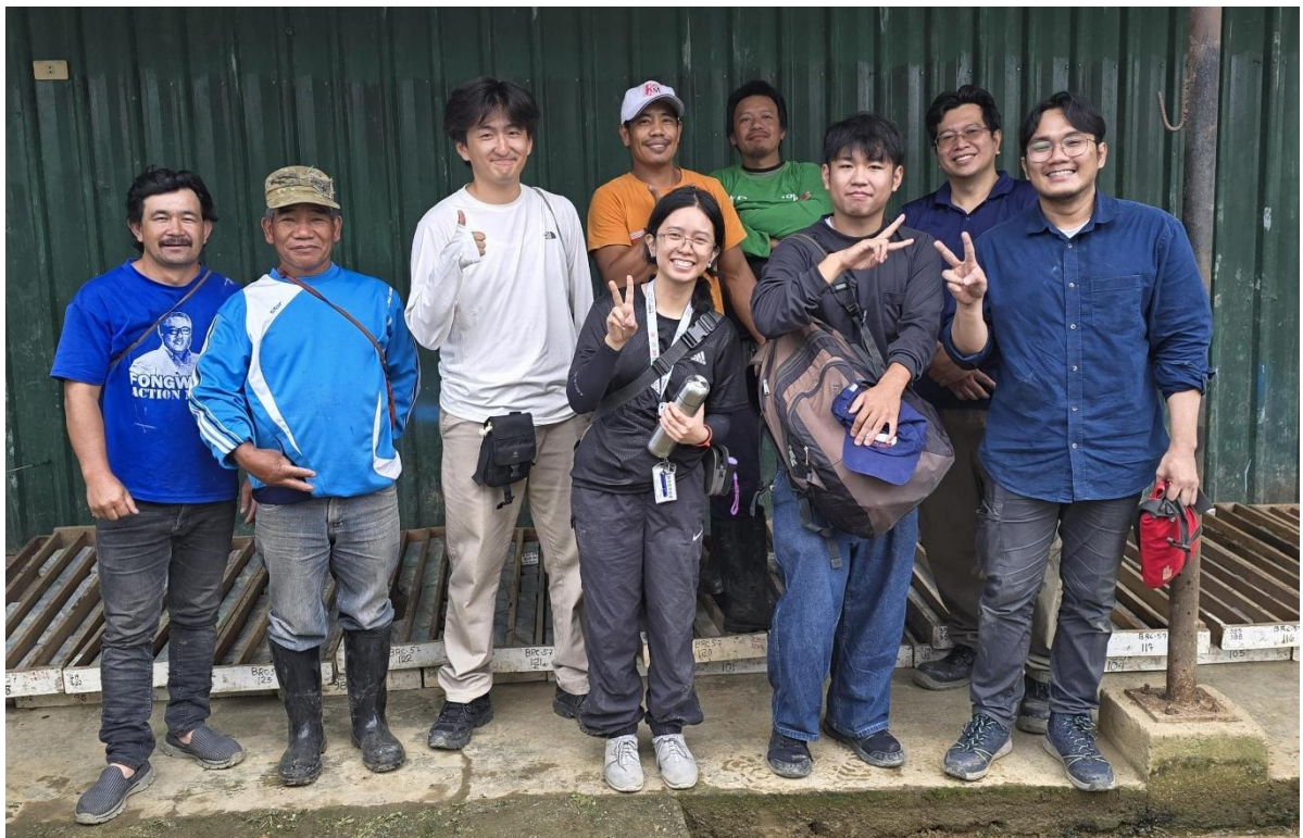
Photo 12. CMDC Core house crew with the students from UP-NIGS and Kyushu University.