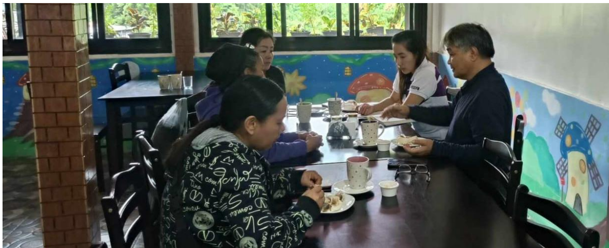
Photo 21. Meeting MENRO for coordination with CMDC's environmental activities.