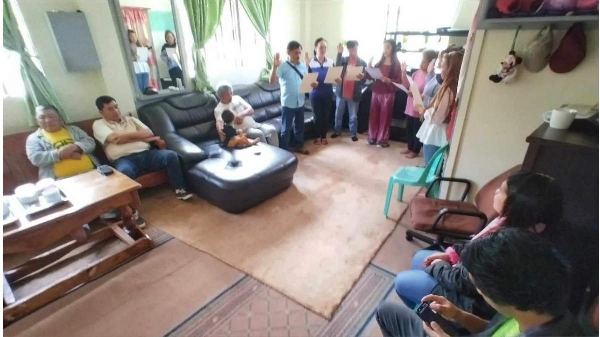
Photo 17. Induction of Guinaoang Coffee Farmers Association.