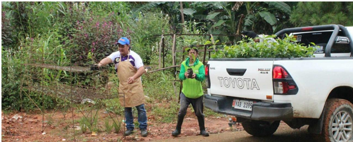
Photo 22. Delivery of coffee seedlings for the Eco Park.