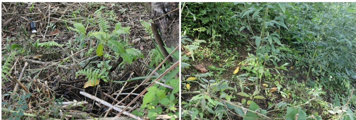
Photo 25. Monitoring of the donated coffee seedlings planted in Jimenez Farm.