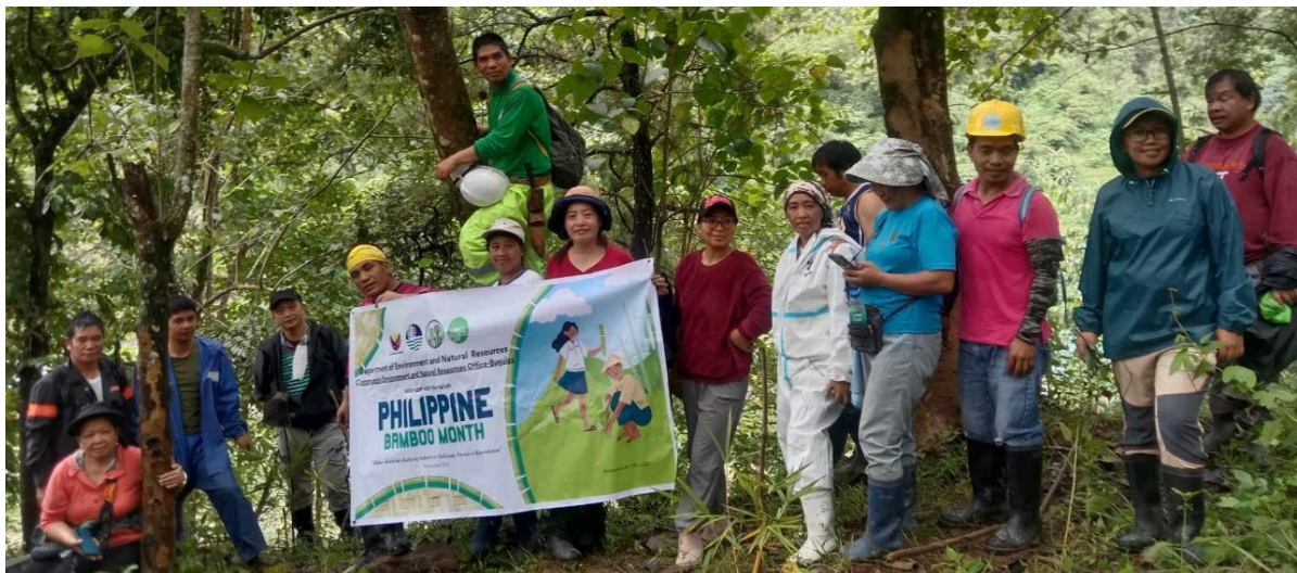
Photo 23. CMDC joins the bamboo planting activity at Brgy. Colalo.