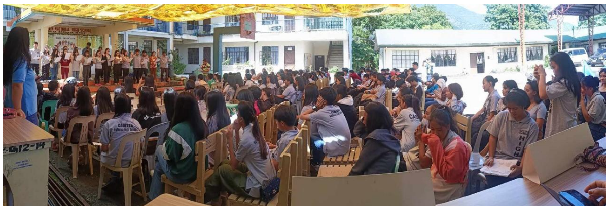
Photo 15. IYAMAN activity at Brgy. Cabiten.