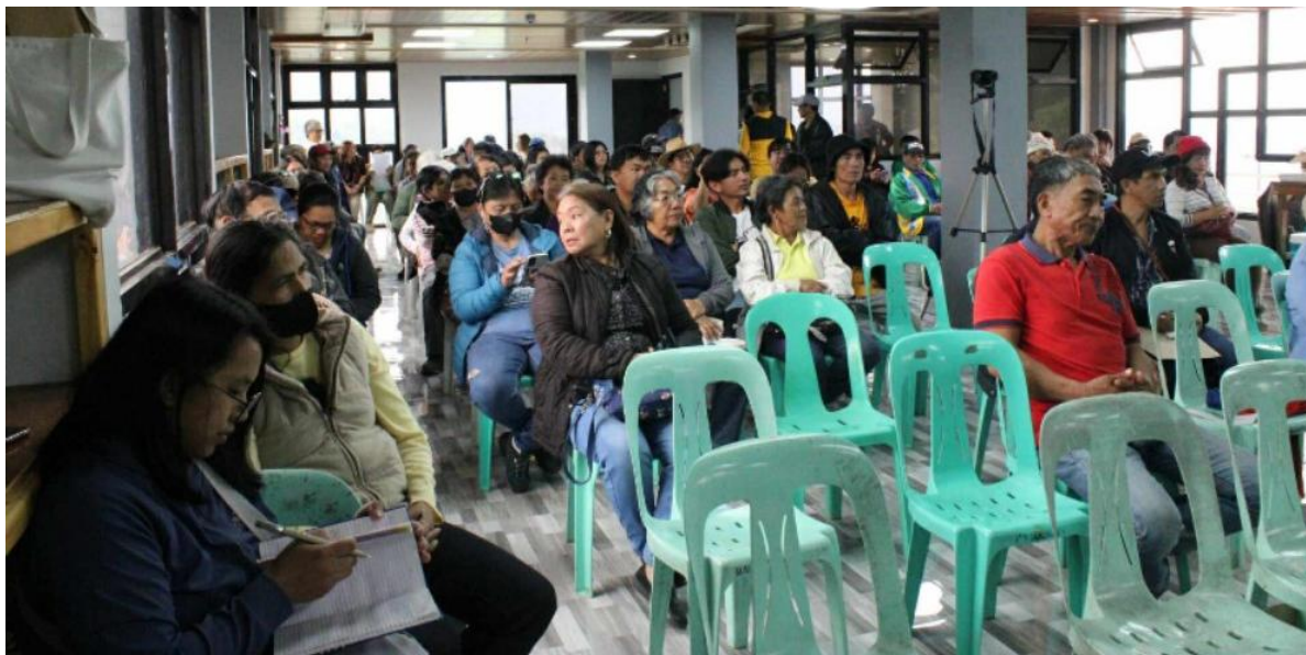
Photo 18. Attendees of the 2 nd MOA negotiations.