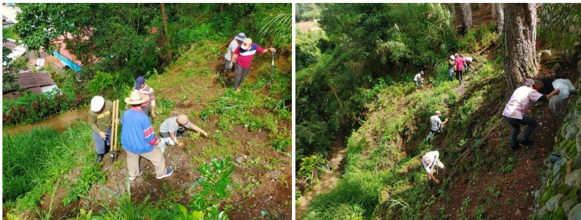
Photo 24. Delivery of coffee seedlings for the Eco Park. Tree planting activity at Brgy. Tabio.