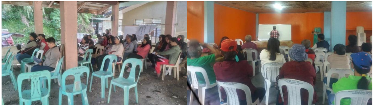
Photo 14. IEC at Brgy. Taneg (left) and Brgy. Paco (right) in preparation for MOA meeting.