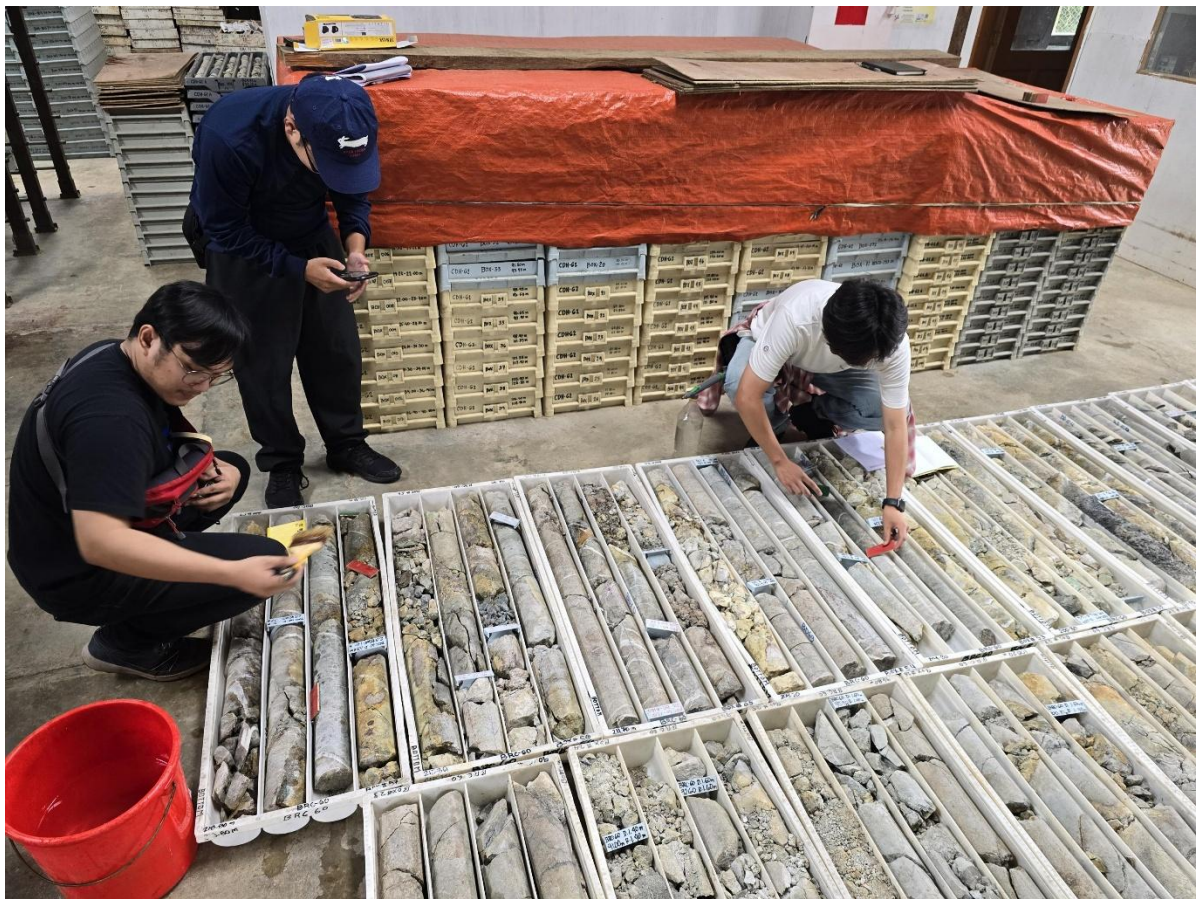
Photo 8. With the use of a small a red plywood, students are marking the intervals where they plan to take samples for the study topics.