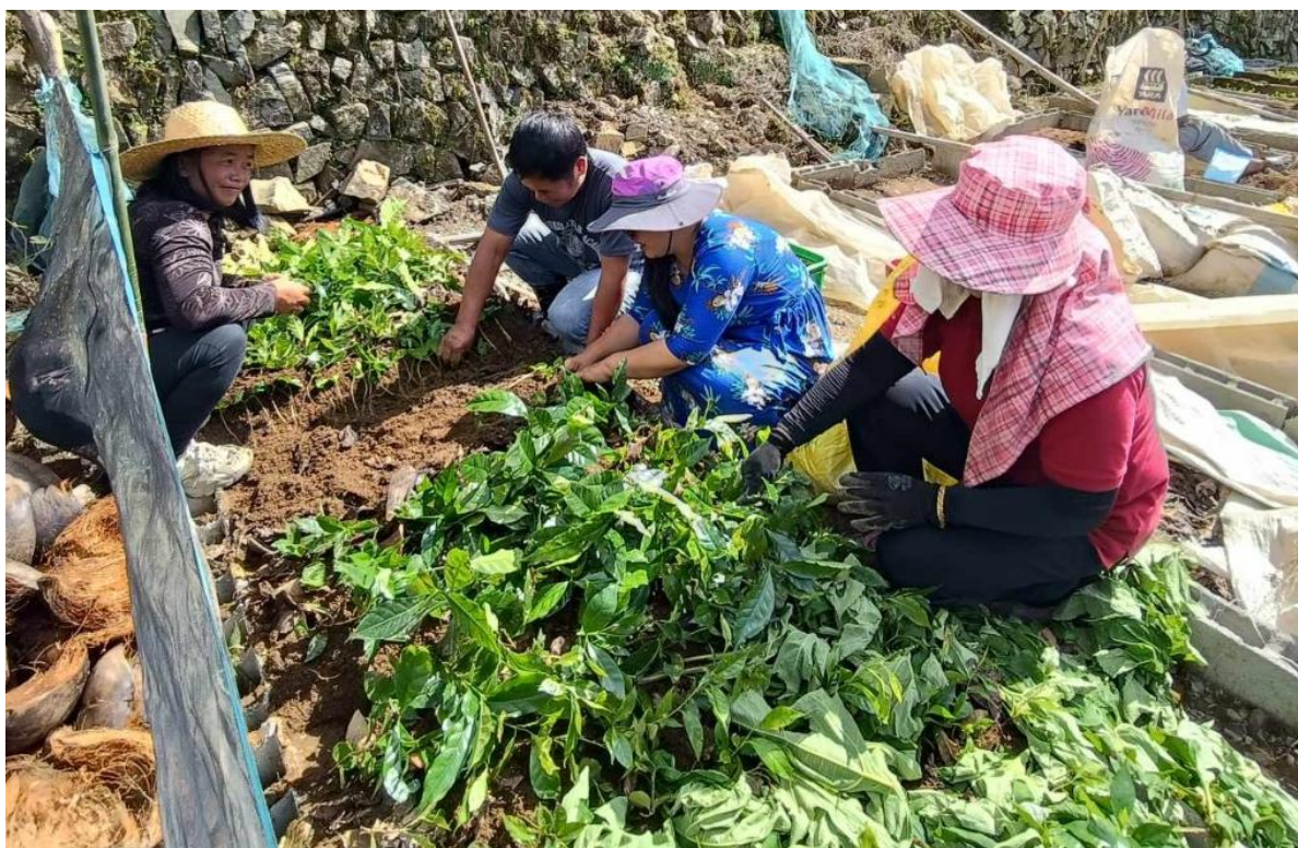
Photo 26. CFs replanting the wild coffee seedlings in the CMDC Nursery.