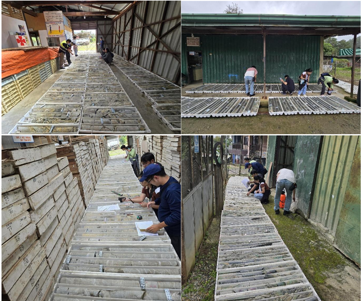
Photo 4. Discussions on the geology, alteration, and mineralization of BRC-60.