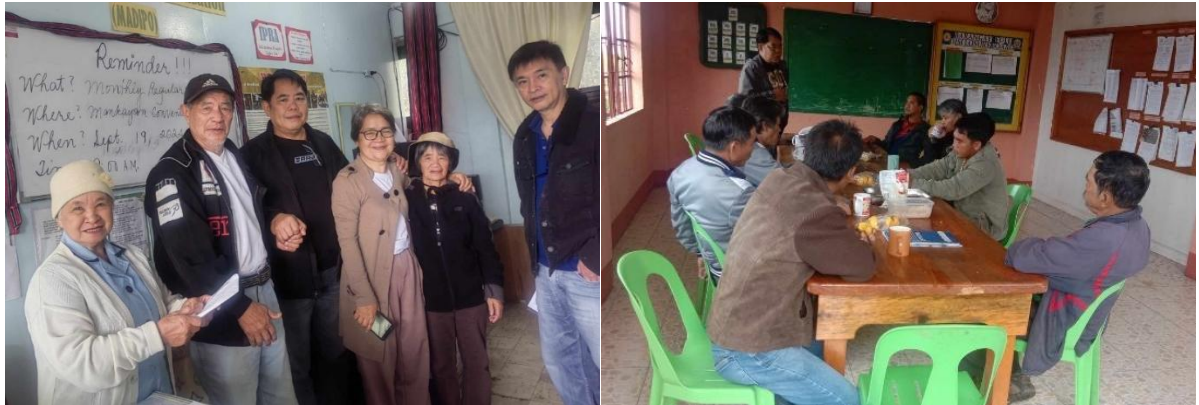
Photo 13. Continuous engagement and IEC with MADIPO (left) and Brgy. Colalo (right).