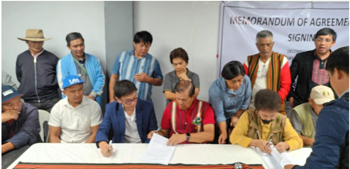
Photo 15. Signing of Resolution of Authority and MOA with the community.