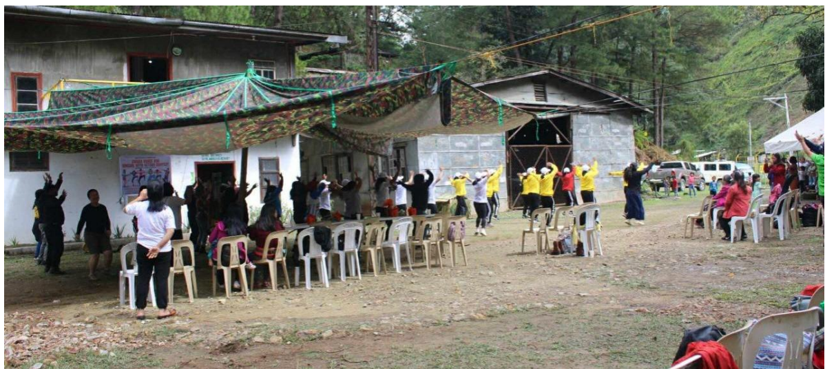
Photo 11. Attended Women’s Organization Assembly at ISRI.