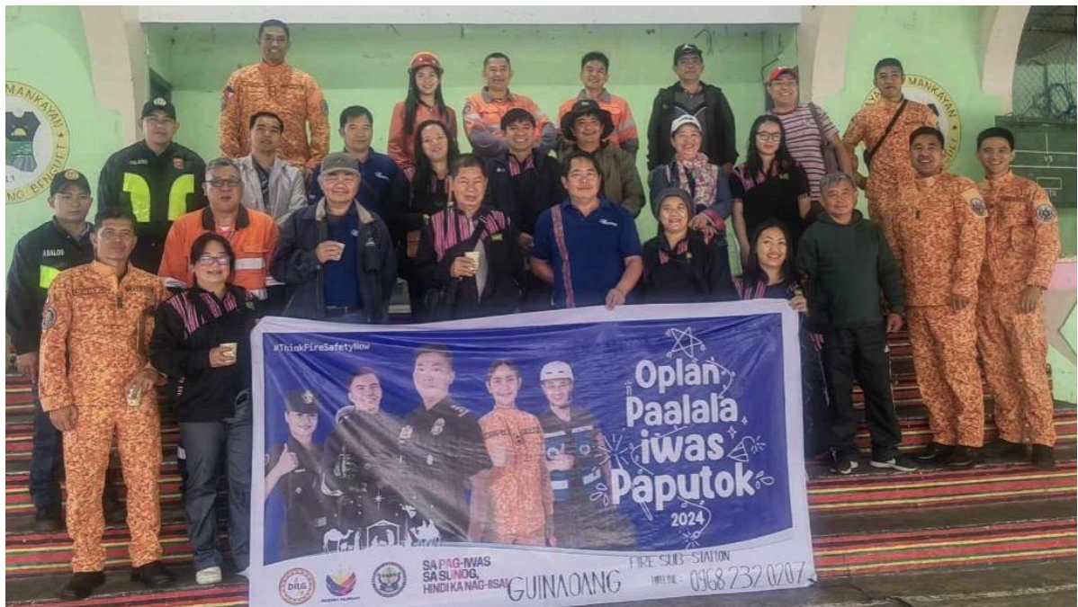
Photo 10. CMDC joins “Oplan Iwas Paputok” in cooperation with Mankayan LGU, Bureau of Fire Protection, and Philippine National Police.