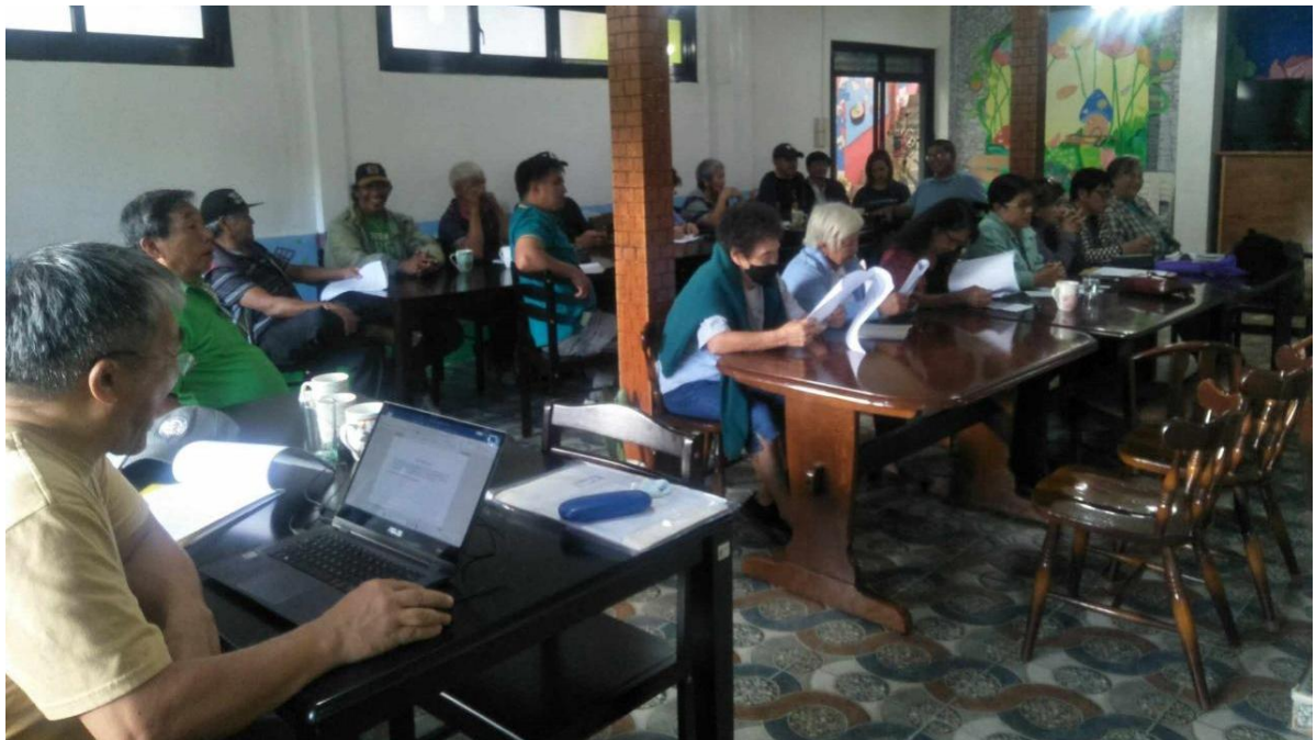
Photo 13. Meeting of COELS (24 barangay Spokespersons) before the formal MOA signing held last Dec 17.