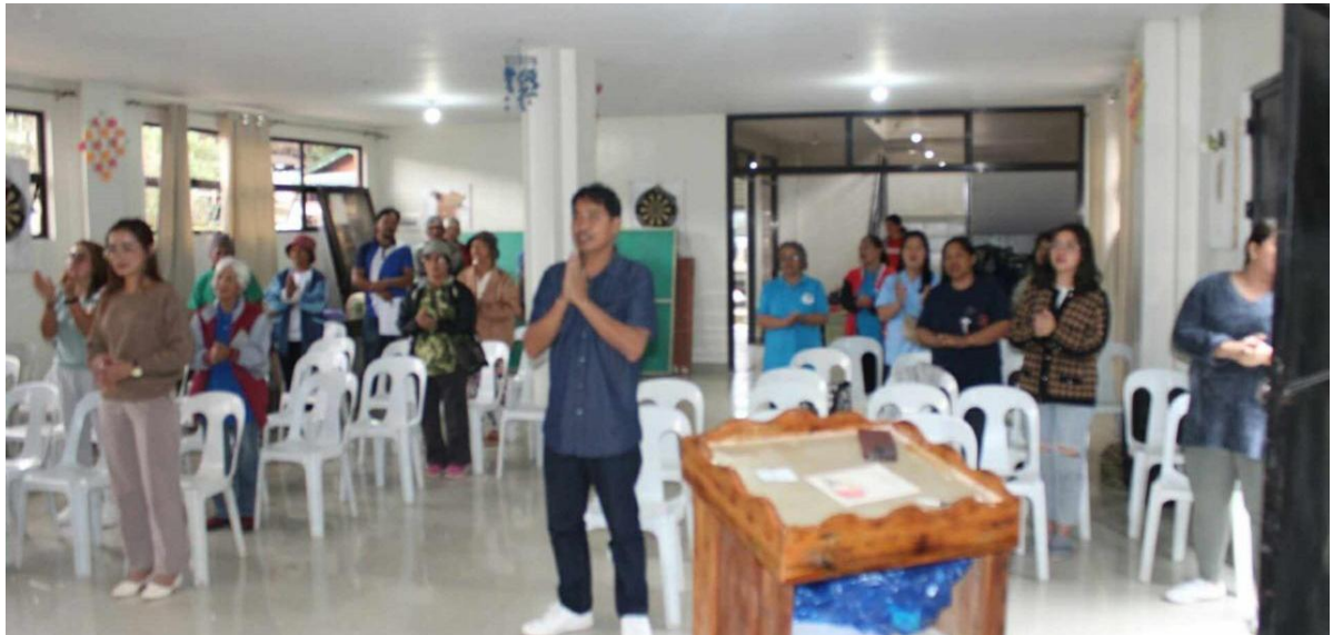
Photo 12. Attended the Brgy. Guinaoang Christmas Party.