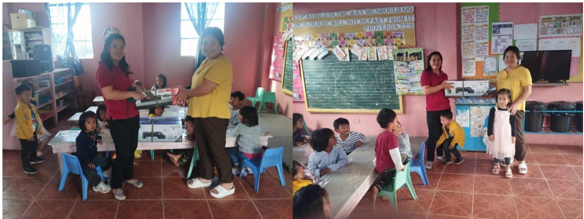
Photo 20. Turnover of laminating machine requested by Brgy. Taneg Day Care Center.