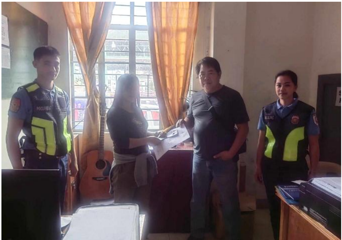
Photo 19. Turnover of cash assistance to PNP-MAGPTD.