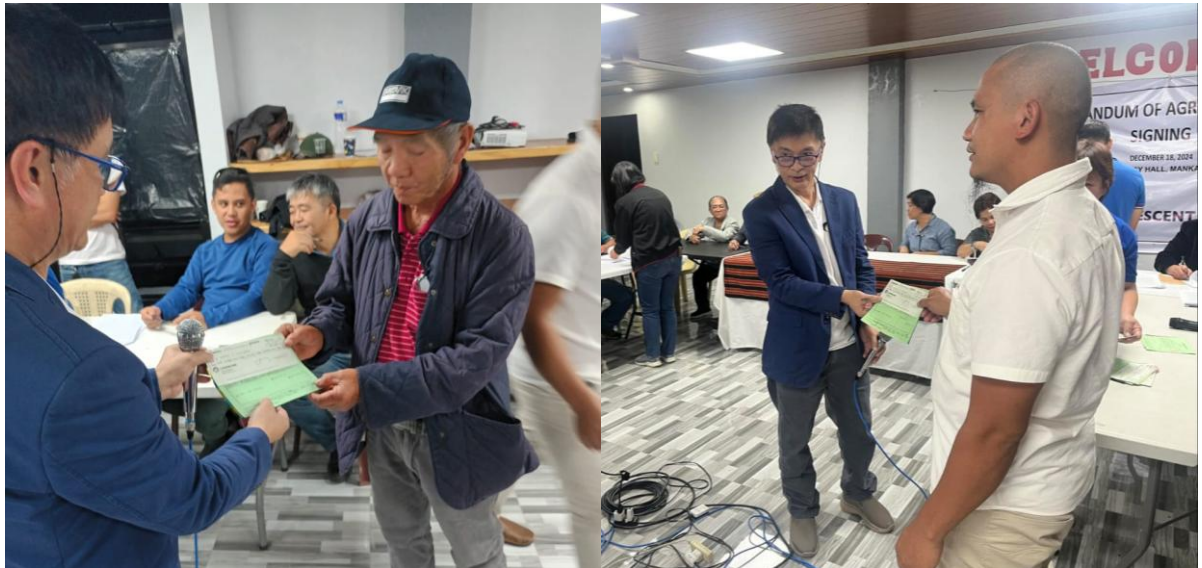
Photo 17. Turnover of cheques to the community.