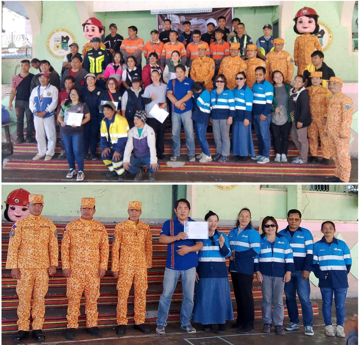
Photo 16. (Top) CMDC staff and other attendees of the motorcade activity of Mankayan Bureau of Fire Protection. (Bottom) CMDC receives a Certificate of Appreciation from Mankayan BFP