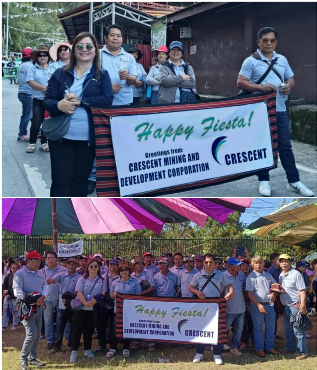
Photo 17. CMDC staff, community facilitators, and coordinators joined the Mankayan Fiesta celebration.