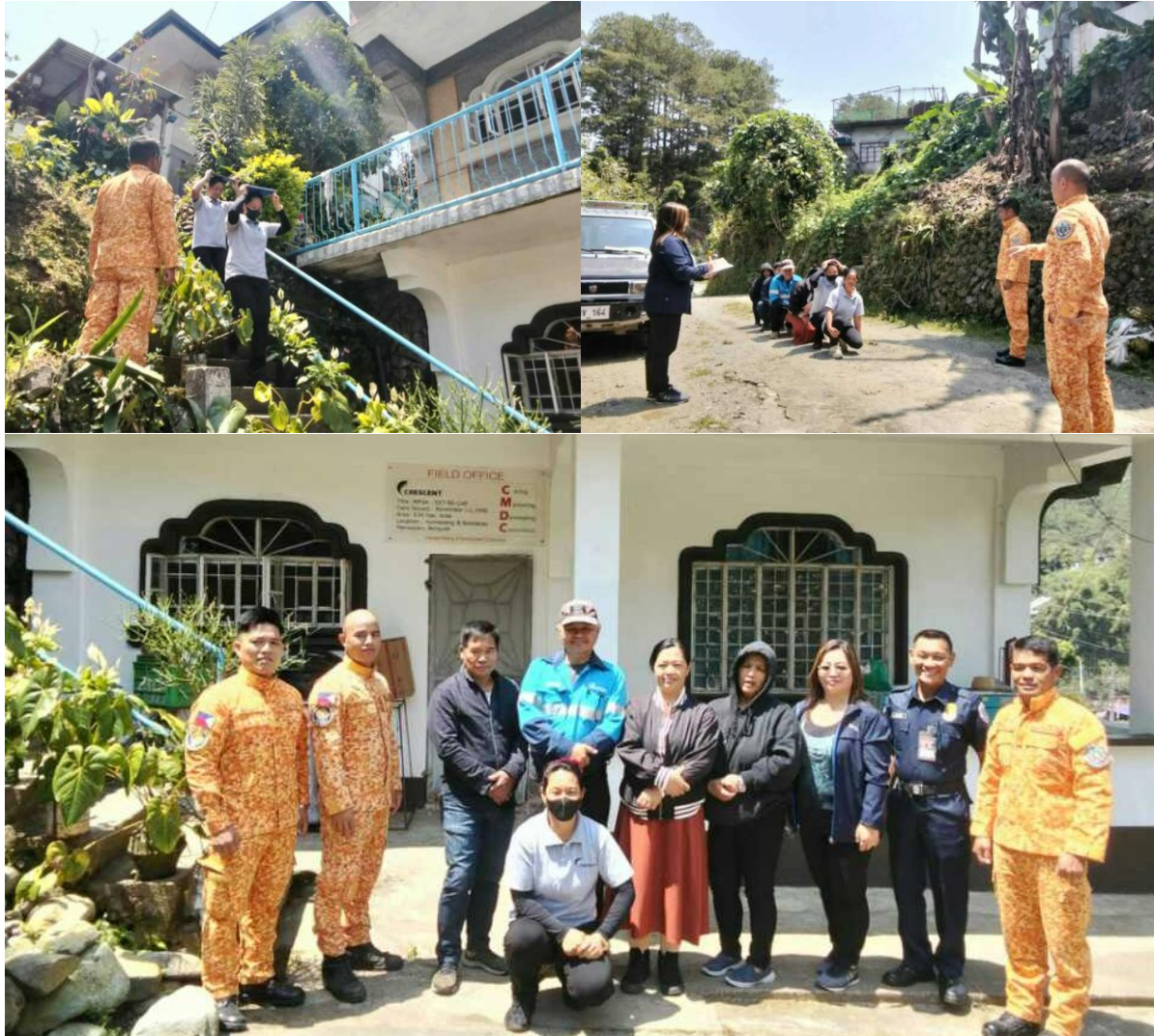
Photo 1. Mankayan BFP supervised the earthquake evacuation drill training of the CMDC Staff.