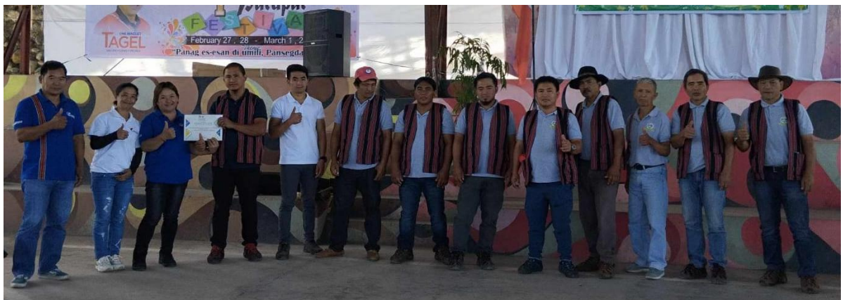
Photo 15. During the Brgy. Colalo Fiesta Celebration, local officials gave CMDC a Certificate of Appreciation for the assistance given by the company to the community.