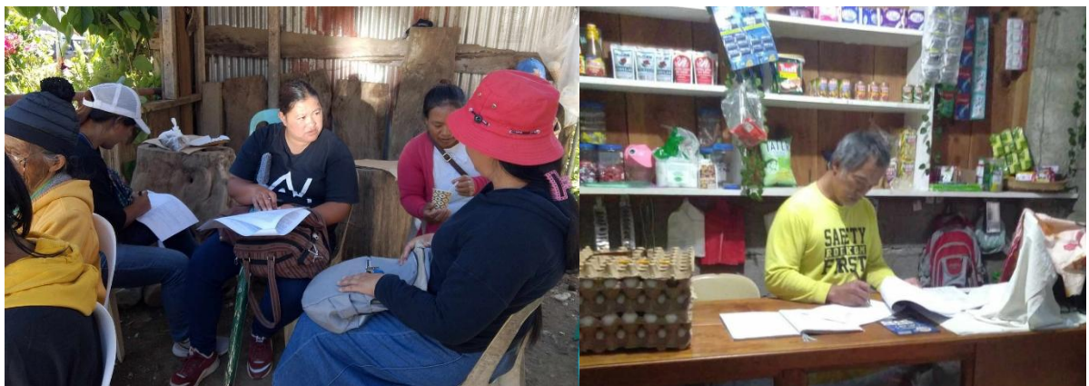
Photo 11. Perception Survey at Brgy. Balili.