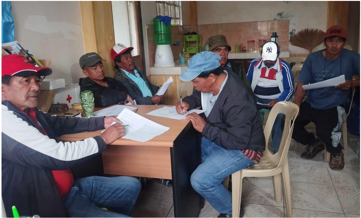
Photo 14. Perception Survey for Brgy. Bulalacao.