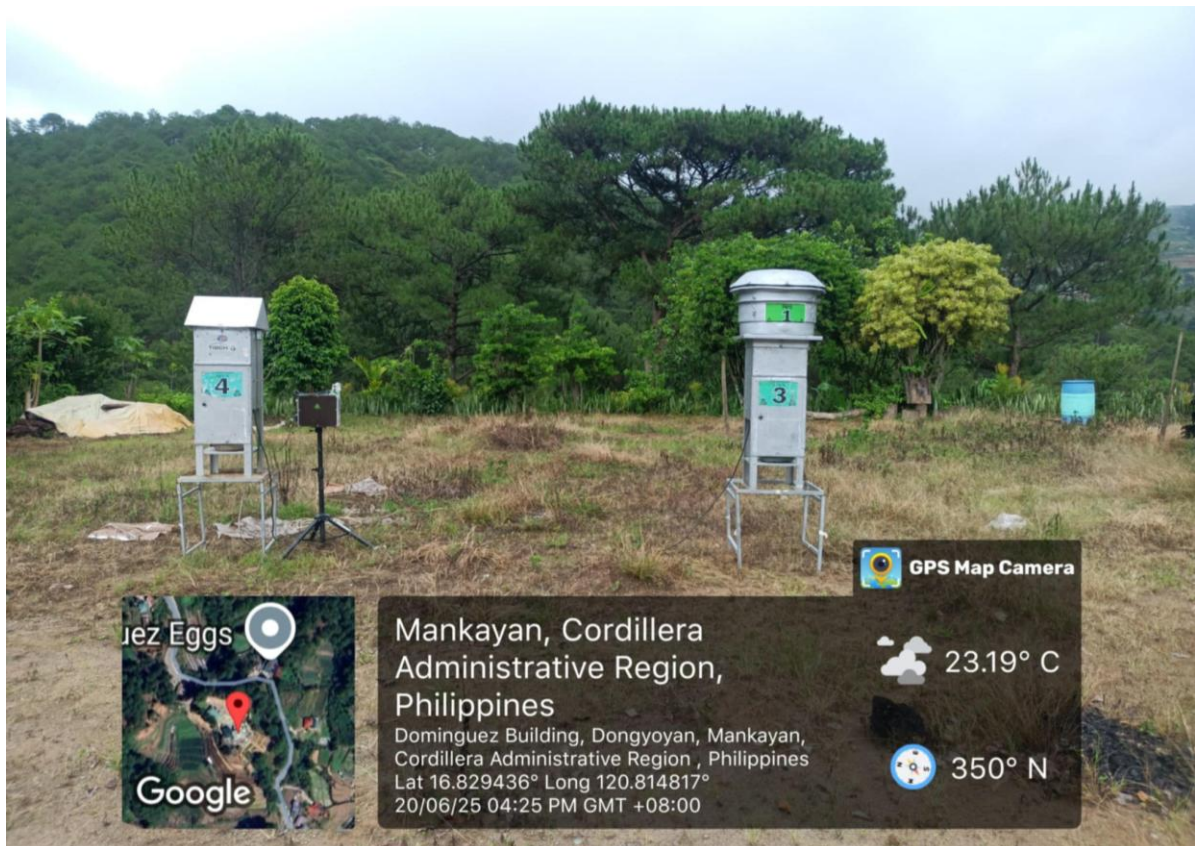
Photo 17. 4 th air quality monitoring station at Dongyoyan, Brgy. Guinaoang.