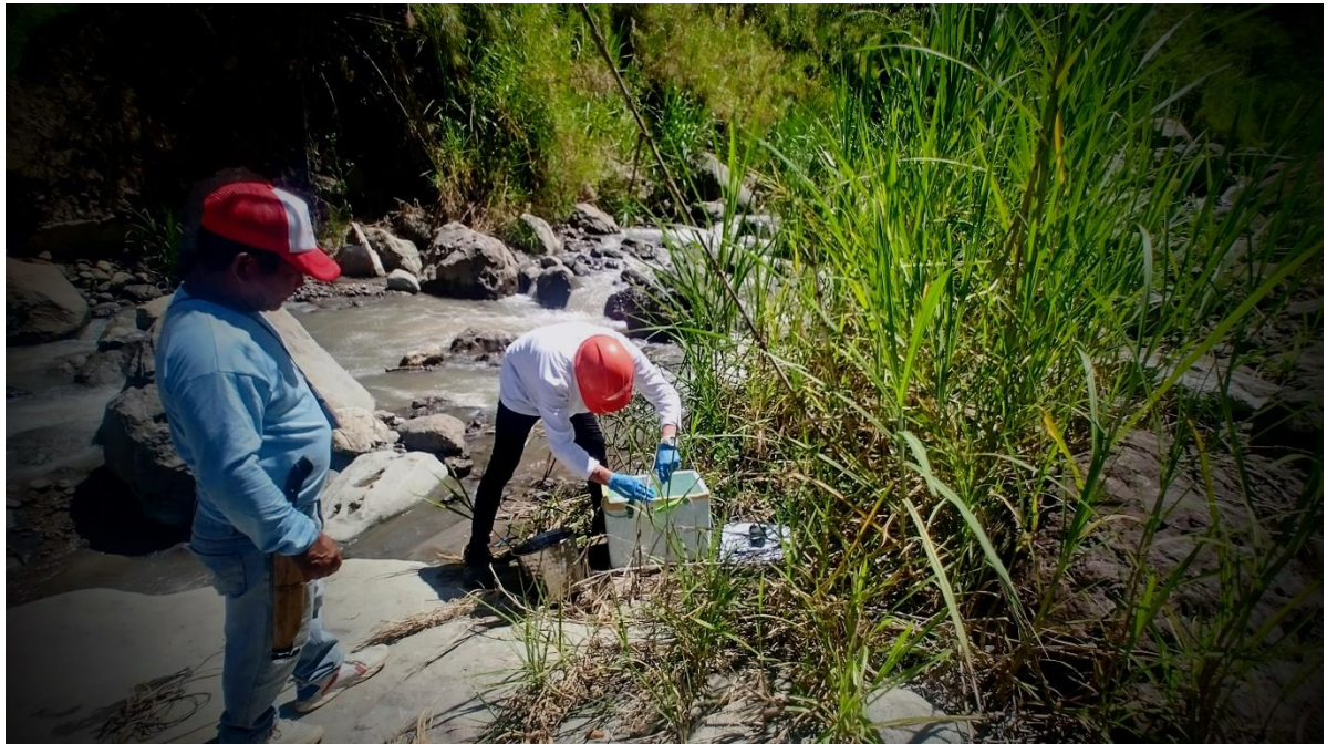
Photo 21. Water sample collection at Apaoan River.