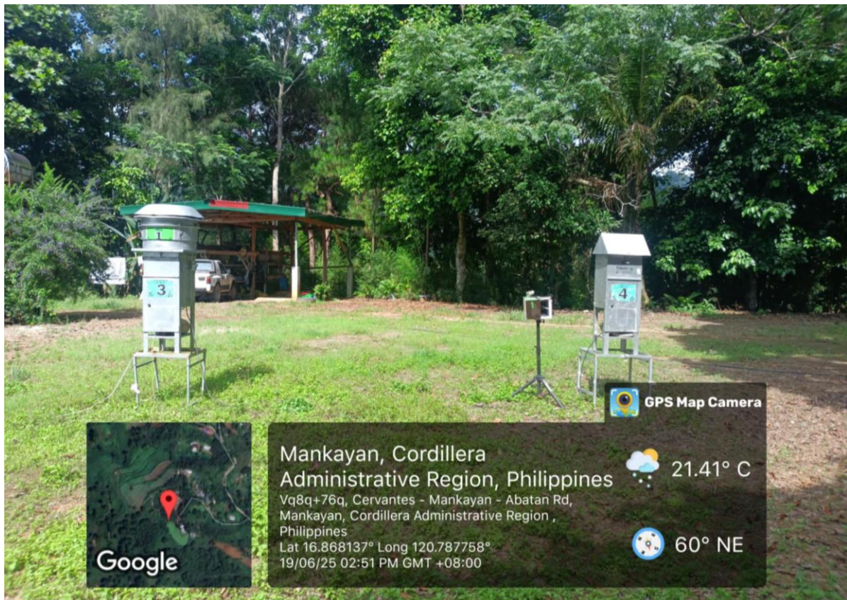
Photo 16. 3 rd air quality monitoring station at Bayuyo, Brgy. Tabio.