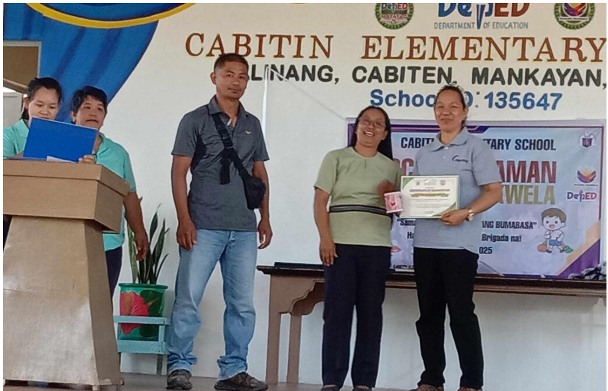
Photo 24. "IYAMAN" activity at Malinang Elementary School in Brgy. Cabiten.