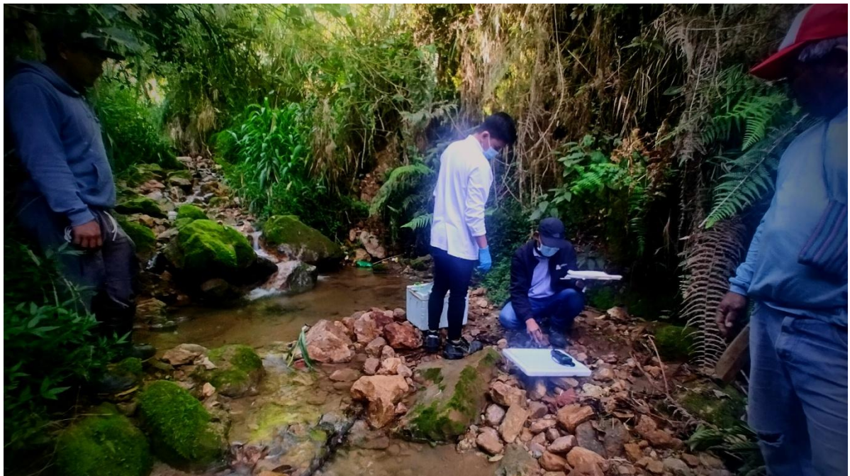
Photo 20. Water sample collection at Colocol Creek.