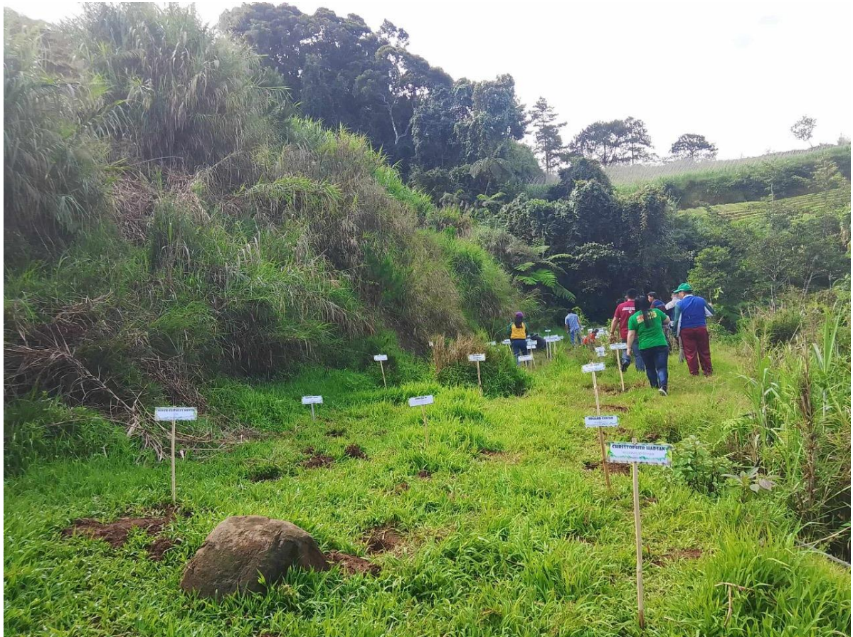
Photo 46. (Top) CMDC SES Nico Laza in the ceremonial signing of MOA with Mogao Integrated School. (Bottom) 370 coffee seedlings planted in the vicinity of the school.