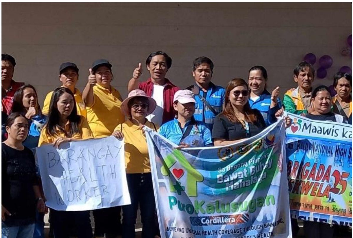
Photo 27. CMDC CFs, teachers, and parents as volunteers for the cleaning activities in Bulalacao National High School “Brigada Eskwela 2025” activities.