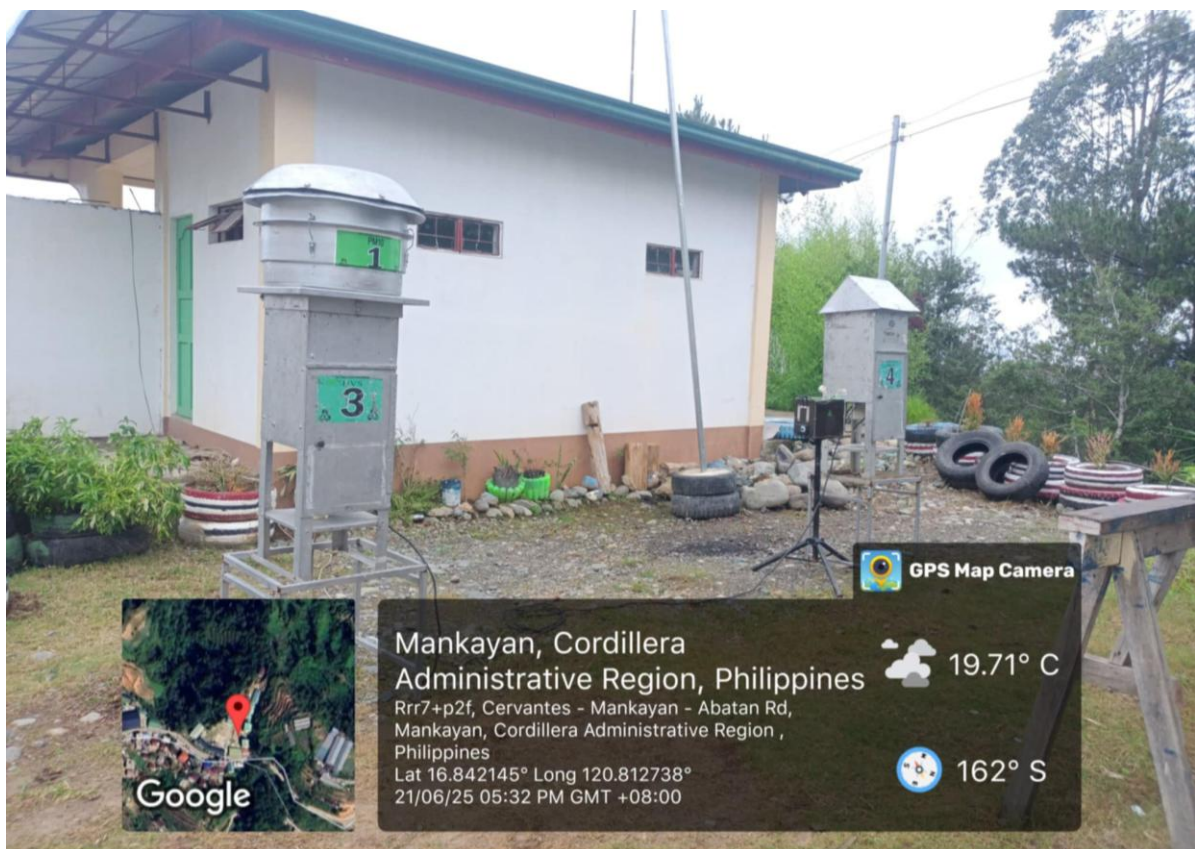
Photo 18. 5 th air quality monitoring station at Bulalacao National High School, Brgy. Bulalacao.