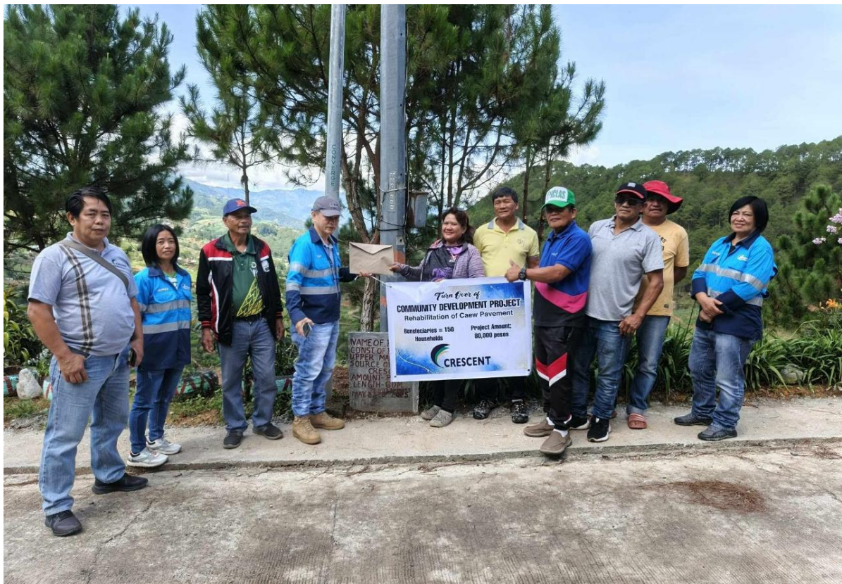
Photo 36. Turnover ceremonies of the completed construction of pathway in Sitio Caew, Brgy. Bulalacao.