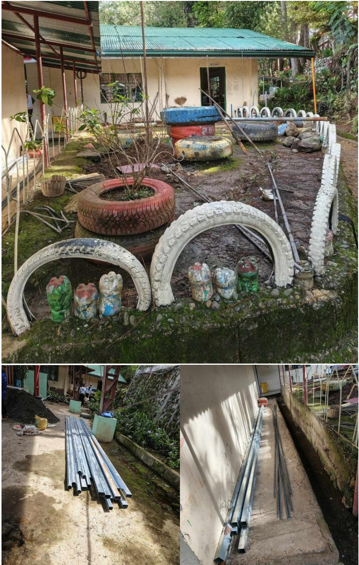
Photo 41. (Top) Proposed site for the Guinaoang National High School SMART Park. (Bottom) Turnover purchased materials for the construction of SMART Park.