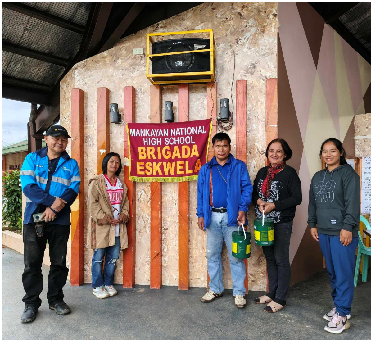
Photo 33. Donated paints for the Brigada Eskwela 2025 activity of Mankayan National High School.