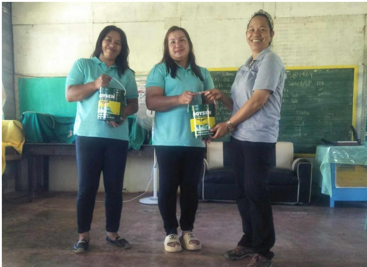
Photo 34. Donated 2 gallons of paint for the improvement of roofs of Malinang Elementary School.