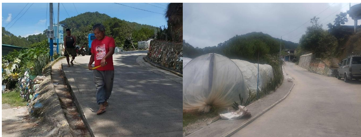
Photo 35. (Left) Measurement of proposed pathway before the project started. (Right) Completed pathway as of June 03, 2025.