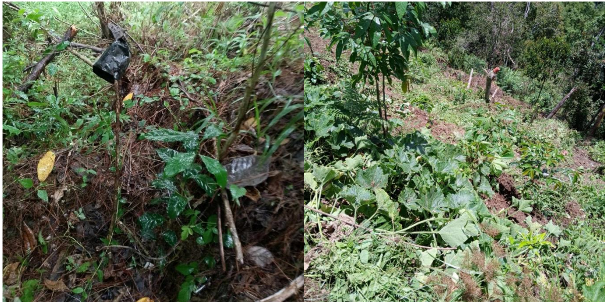
Photo 44. Monitoring of planted coffee seedlings from the Bureau of Plant Industry.