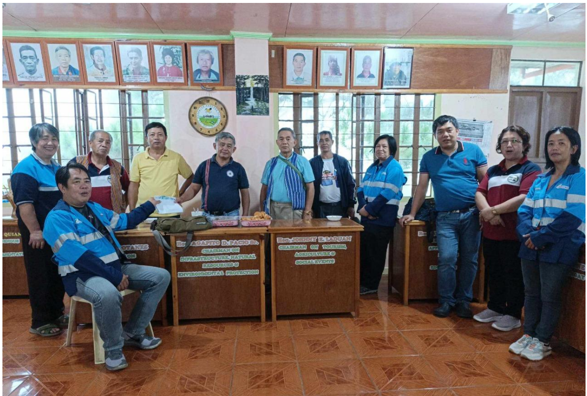
Photo 43. Tabio Barangay Council receiving the cash assistance for the cancer patients in their barangay.