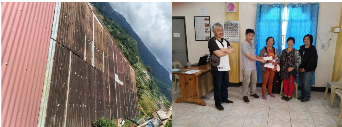
Photo 37. (Left) Roof condition of Manaba Church in dire need of repairs. (Right) Turn over of Php 50,000 check for the purchase of materials needed for the church's repairs.