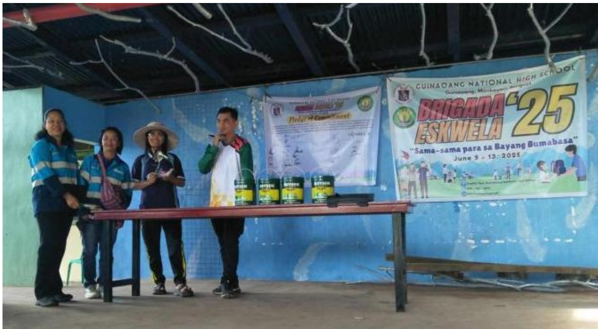
Photo 32. Donated paints for the Brigada Eskwela 2025 activity of Guinaoang Elementary School.