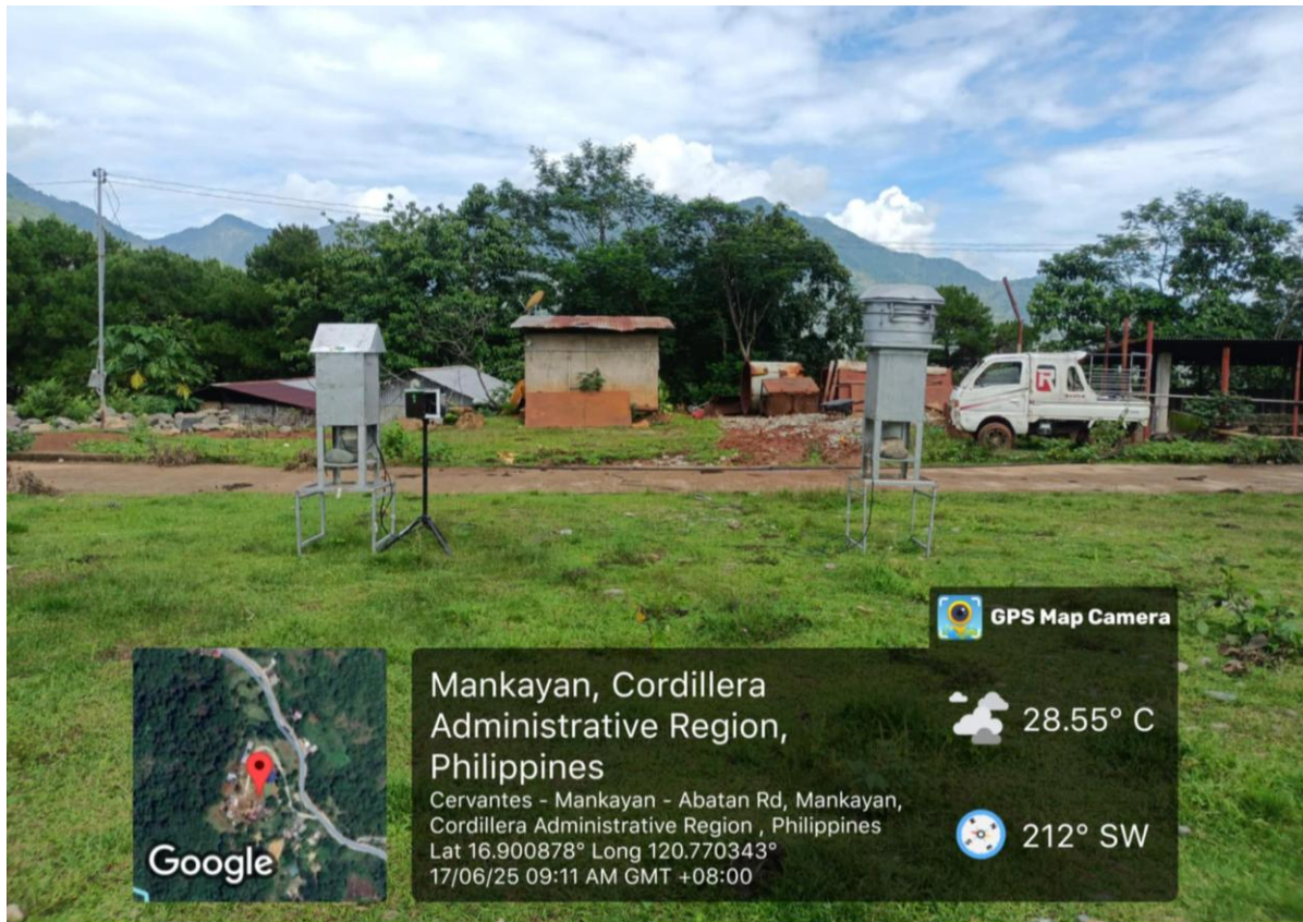
Photo 14. 1 st air quality monitoring station at Lower Colalo, Brgy. Colalo.