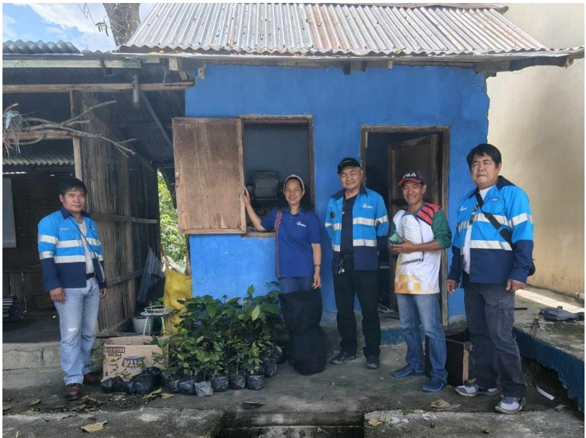
Photo 47. Turnover of nets, cacao seedlings, and pine tree seedlings to Cabiten National High School.