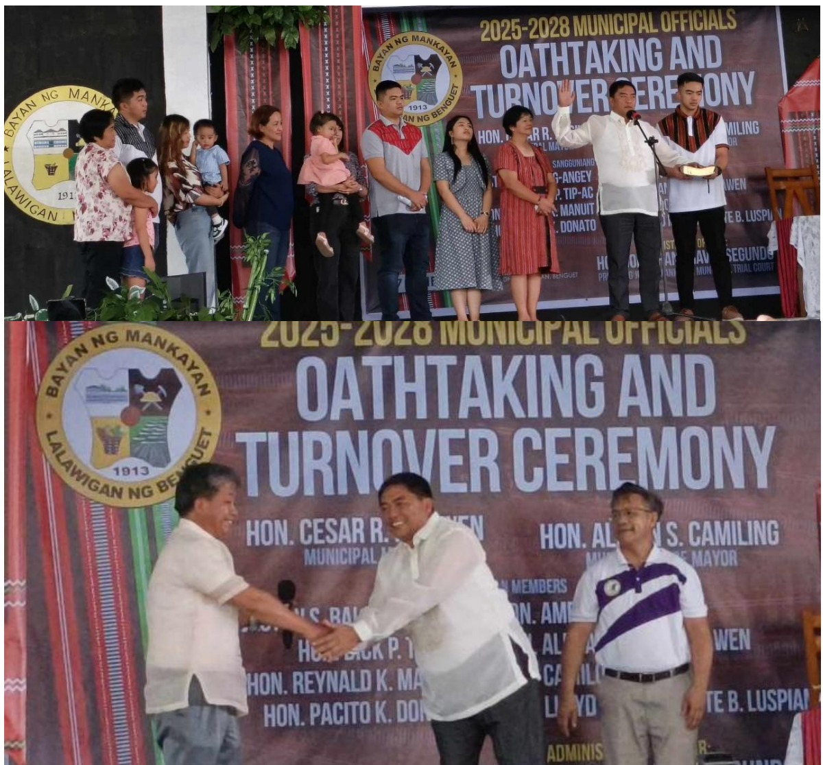
Photo 25. Oath taking and turnover ceremonies of the newly elected Mankayan Mayor Ret. PGen Cesar Pasiwen.