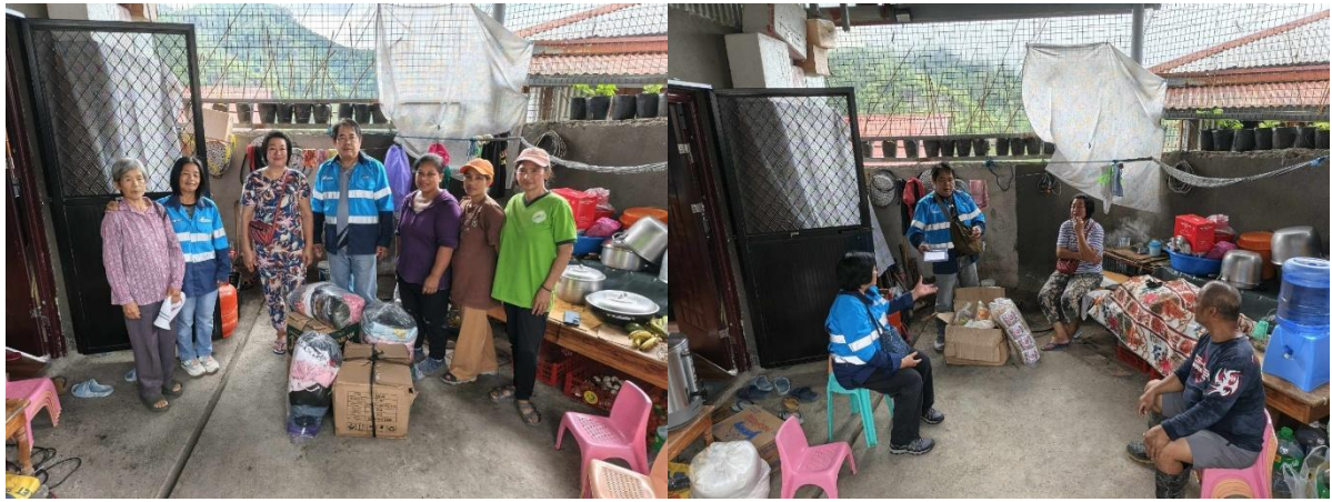
Photo 42. Food supplies, clothing, and cash assistance provided to the victims of fire in Brgy. Sapid.