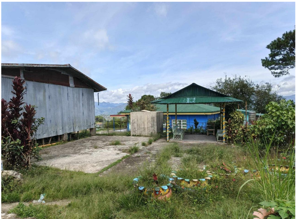
Photo 40. Inspection of the proposed site for the Children’s Playpen in Bulalacao Elementary School. Slides, swings, and other facilities will be built on this site.