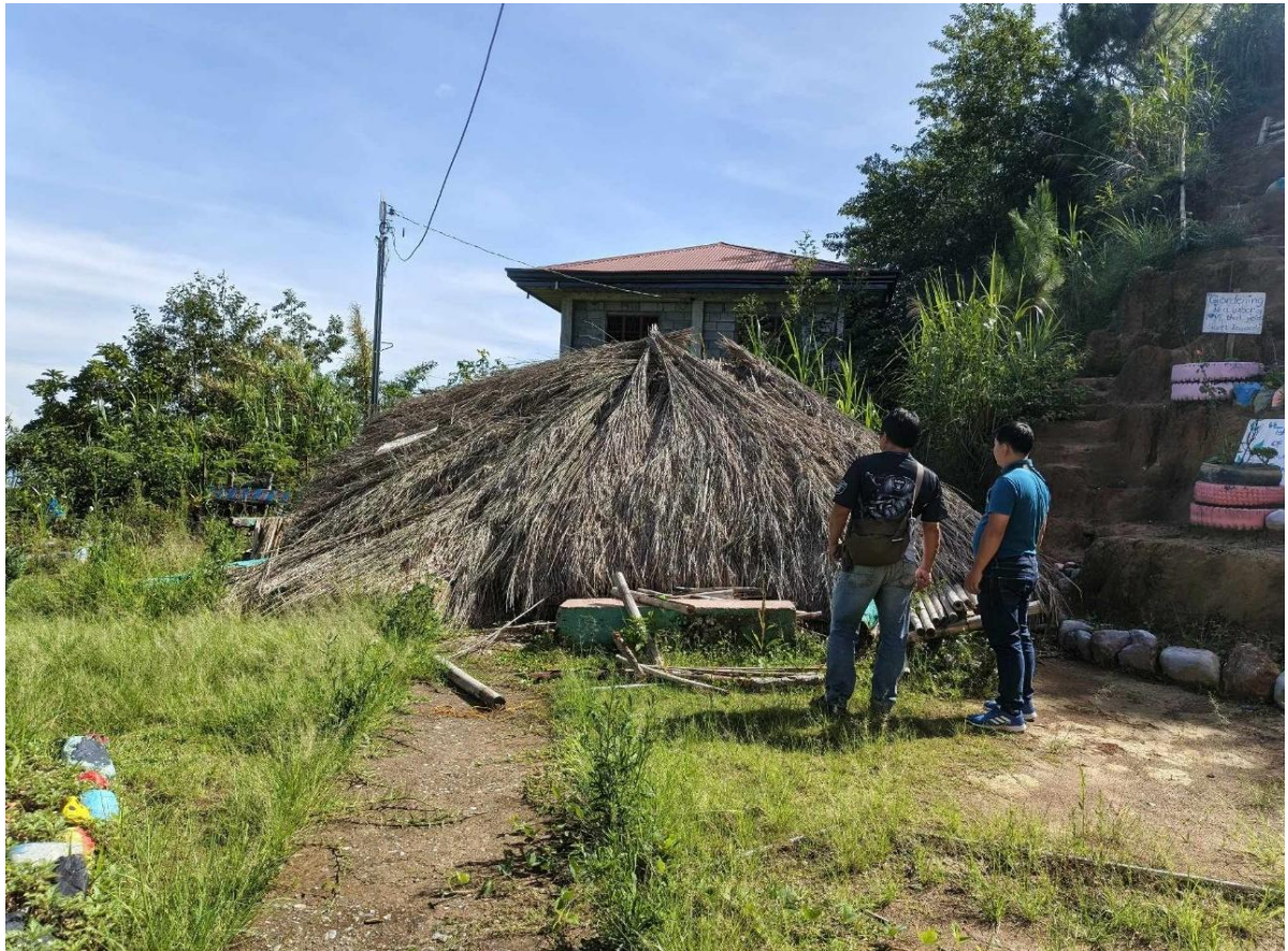
Photo 39. Inspection on the proposed repair of the Learning Center at Bulalacao National High School.