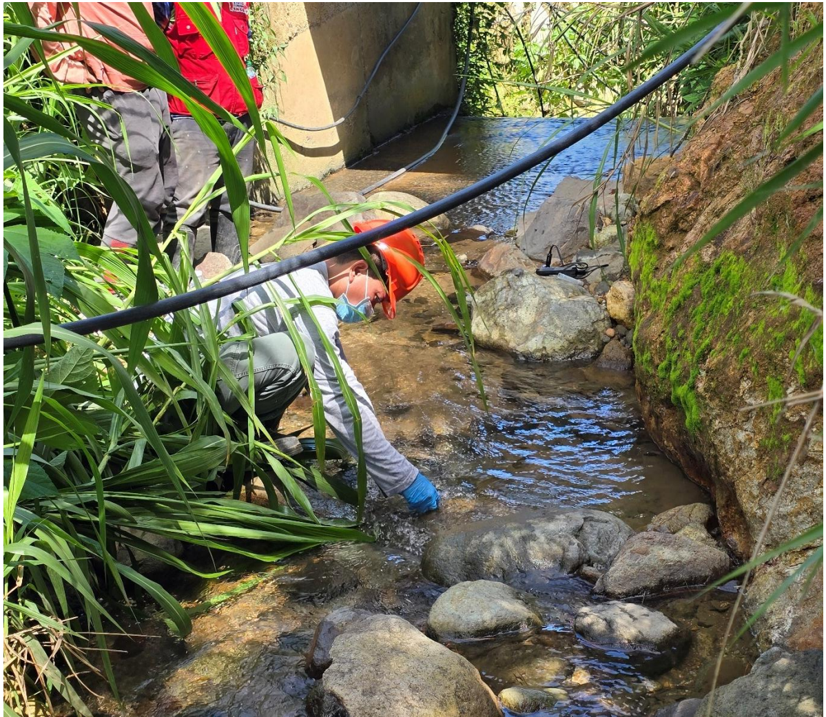
Photo 19. Water sample collection at Labaan Creek.